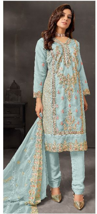
C - 1618 D