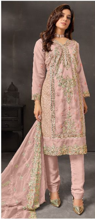
C - 1618