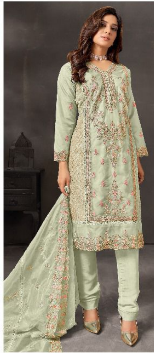
C - 1618 B