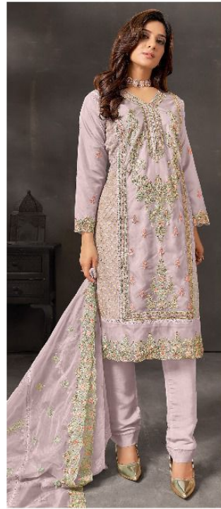
C - 1618 C