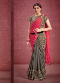
22513 Fabric: Crum Silk with Crepe Georgette Embroidered Ready-to-wear Blouse Accessorized with: A Designer Belt