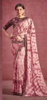
22507 Fabric: Tin Dye Crepe Chantilly Unbordered Ready-to-wear Blouse Accessorized with: A Designer Belt