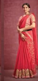
22512 Fabric: Silk Crepe Embroidered Ready-to-wear Blouse Accessorized with: A Designer Belt