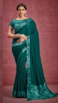
22511 Fabric: Crepe Georgette Katta Sequins Ready-to-wear Blouse Accessorized with: A Designer Belt