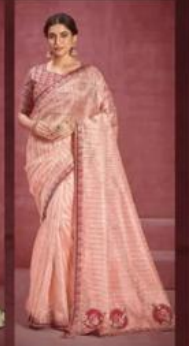
22510 Fabric: Patterned Organza Jacquard Ready-to-wear Blouse