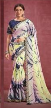
22509 Fabric: Satin Silk Georgette Accessorized with: A Designer Belt