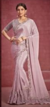
22503 Fabric: Crepe Silk Georgette Jacquard Ready-to-wear Blouse Accessorized with: A Designer Belt