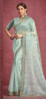
22506 Fabric: Patterned Organza Jacquard Ready-to-wear Blouse