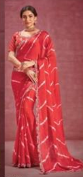
22505 Fabric: Satin Silk Georgette Embroidered Ready-to-wear Blouse