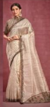
22508 Fabric: Patterned Organza Coca Sequins Ready-to-wear Blouse