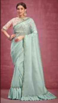
22500 Fabric: Net Organza Ready-to-wear Blouse