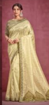
22504 Fabric: Patterned Organza Jacquard Ready-to-wear Blouse