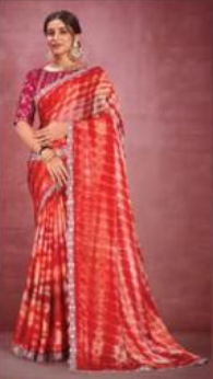
22501 Fabric: Satin Silk Georgette Embroidered Ready-to-wear Blouse Accessorized with: A Designer Belt