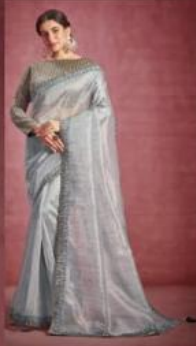
22502 Fabric: Patterned Silk Organza Jacquard Ready-to-wear Blouse