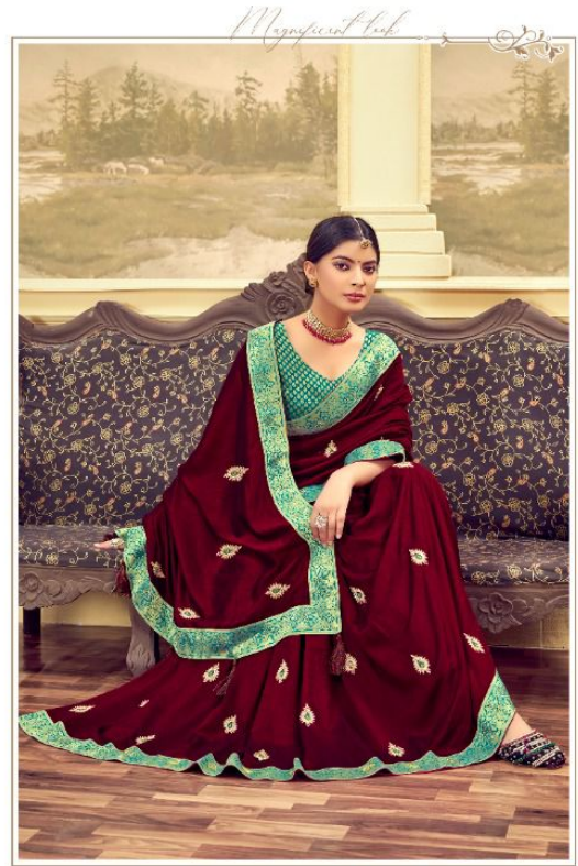
BLOOMING WINE VICHITRA SILK SAREE WITH EMBROIDERED BUTTIES AND SWAROVSKI HAVING BROCADE BORDER WITH SWAROVSKI WORK AND TUSSELS, PAIRED WITH RAKA BROCADE BLOUSE