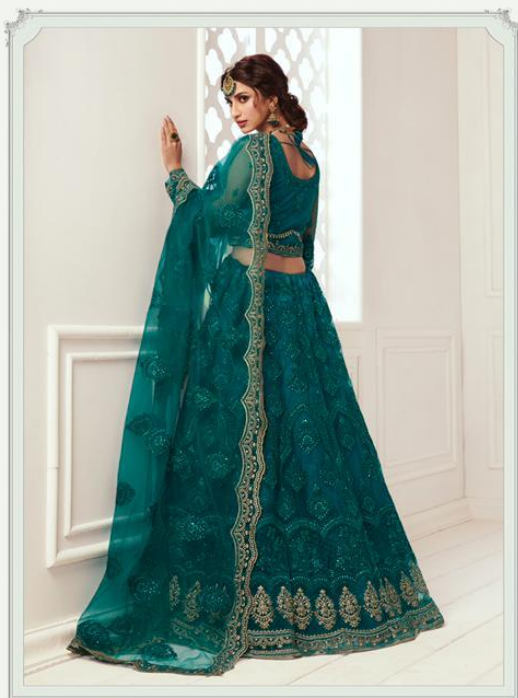
The most interesting fashion trends 1008-C