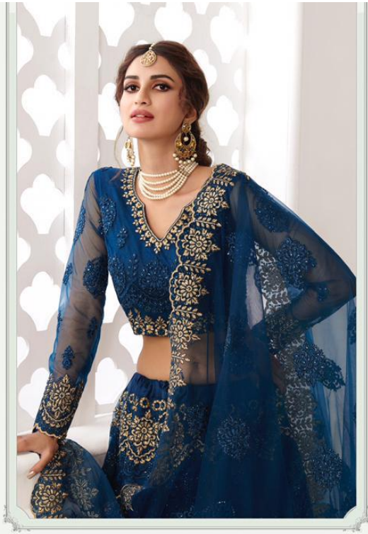
Immerse yourself in unexpected, bright colors & Textures 1007-B