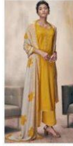
D.NO :- C0202