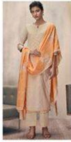
D.NO :- C0201