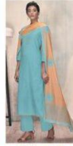
D.NO :- C0204