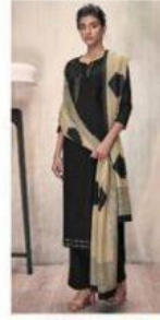
D.NO :- C0203