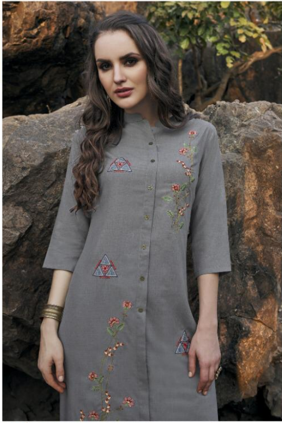
2055 | QUINTESSENCE OF A ROYAL