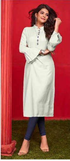
..... 51 .....