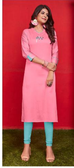
..... 53 .....