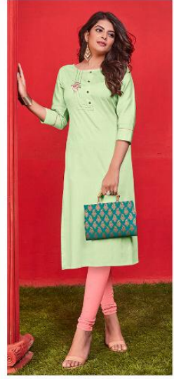
..... 54 .....