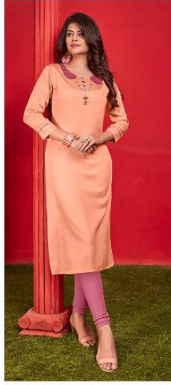
..... 52 .....