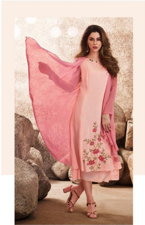
309 CONFORMING TO GOOD TASTE