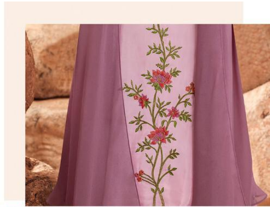
Embroideries bring to life glamorous & innovative garment.