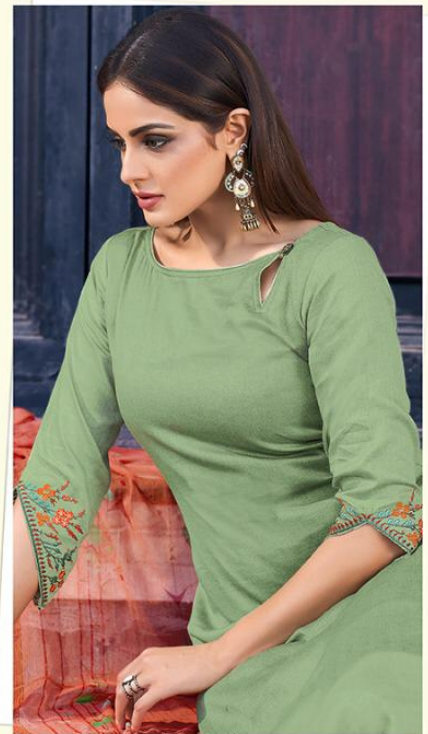
The world of Beautiful Bridals...