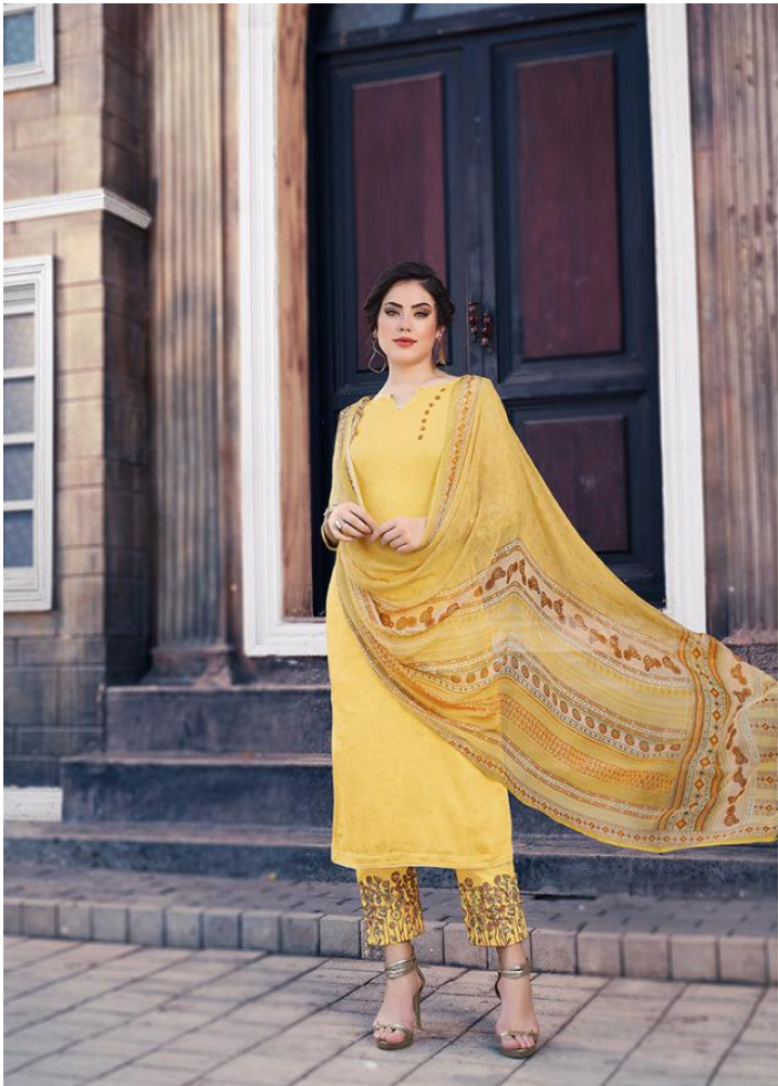
Paricat is beauty and charisma personified, with the playful allure of the panjabi.