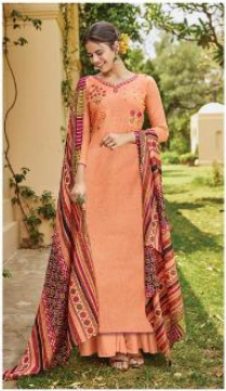
CODE # 9404