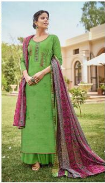
CODE # 9405