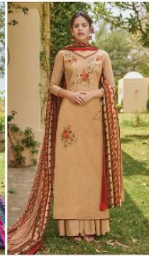
CODE # 9410