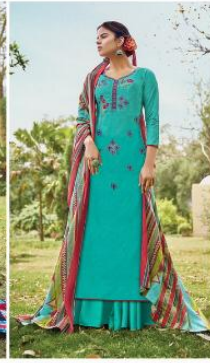
CODE # 9407