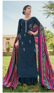
CODE # 9409