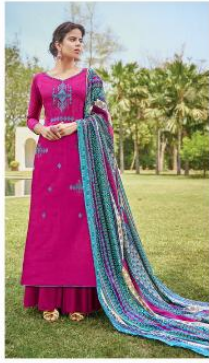
CODE # 9401