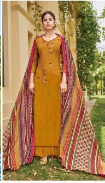
CODE # 9402