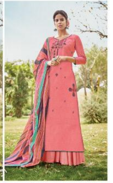
CODE # 9408