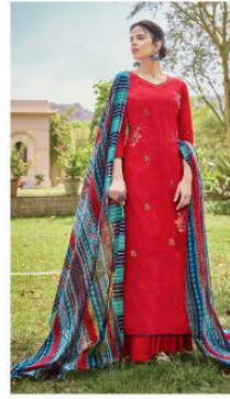
CODE # 9406