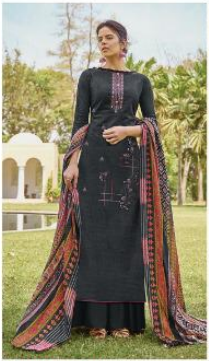
CODE # 9403