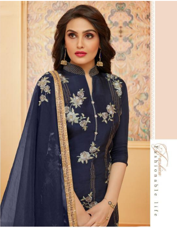
Design brings flashy patterns on natural fabric which turns even the simplest style into something worth while.