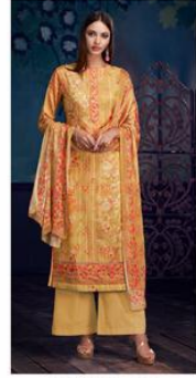
STYLE.NO - 6808