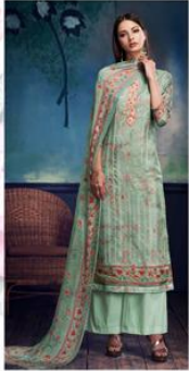
STYLE.NO - 6804