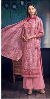
STYLE.NO - 6805