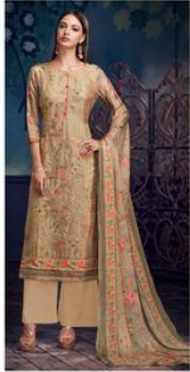
STYLE.NO - 6806