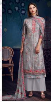
STYLE.NO - 6807