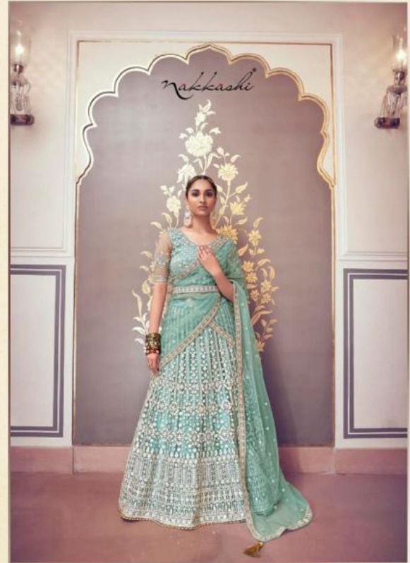
AQUA BLUE NET LEHENGA HAVING MIRROR WORK ON IT AND DECORATED WITH JARIAN, HAVING SAME COLOUR NET DUPATTA WITH ZARI AND JARIAN WORK ON IT, PAIRED WITH SAME COLOUR EMBROIDERY BLOUSE AND KURT