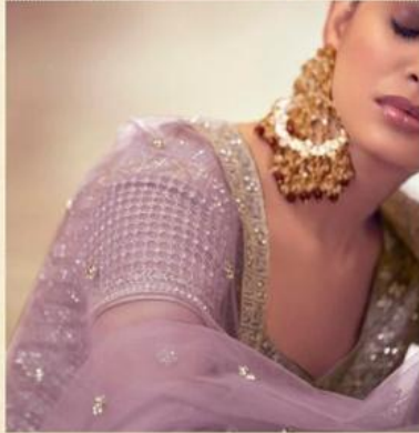
DURTY MOVIE NET LEBENGA HAVING ZARI WORK ON IT AND DECORATED WITH JAKKAR, HAVING SAME COLOUR NET SHIRT WITH ZARI WORK ON IT, PAIRD WITH SAME COLOUR EMBROIDERY BLOUSE AND BELT