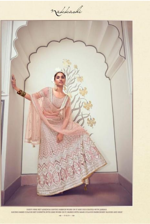
DUSKY PINK NET LEHENGA HAVING MIRROR WORK ON IT AND DECORATED WITH JARRAN. HAVING SAME COLOR NET DUNNETTA WITH ZARI WORK ON IT PAIRED WITH SAME COLOR ENHANCING KEY BLOUSE AND BELT