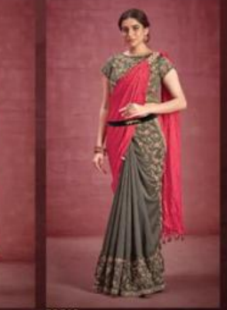
22513 Fabric: Crum Silk with Crepe Georgette Embroidered Ready-to-wear Blouse Accessorized with: A Designer Belt