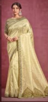
22504 Fabric: Patterned Organza Jacquard Ready-to-wear Blouse