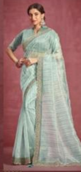
22506 Fabric: Patterned Organza Jacquard Ready-to-wear Blouse