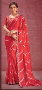
22505 Fabric: Satin Silk Georgette Embroidered Ready-to-wear Blouse