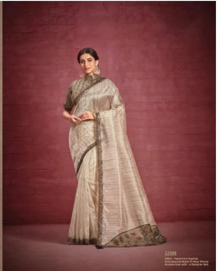
22508 Fabric : Patterned Organza Collar Sequins Ready-To-Wear Blouse Accessories with : A Designer Belt