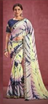
22509 Fabric: Satin Silk Georgette Accessorized with: A Designer Belt