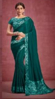
22511 Fabric: Crepe Georgette Kata Sequins Ready-to-wear Blouse Accessorized with: A Designer Belt