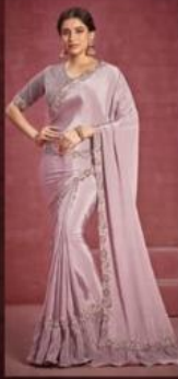
22503 Fabric: Crepe Silk Georgette Jacquard Ready-to-wear Blouse Accessorized with: A Designer Belt