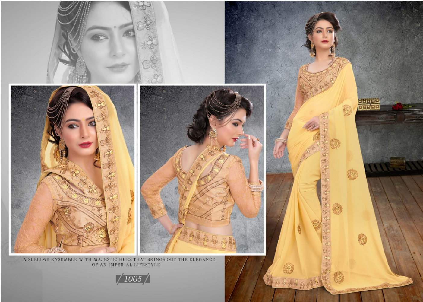
A SUBLIME ENSEMBLE WITH MAJESTIC HUES THAT BRINGS OUT THE ELEGANCE OF AN IMPERIAL LIFESTYLE