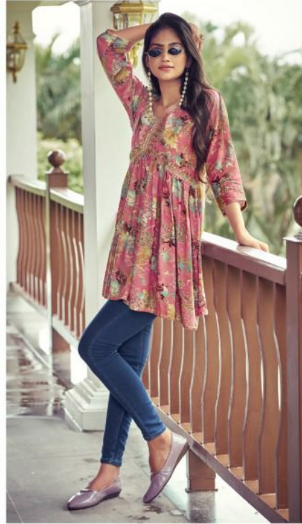
STYLE # 1002