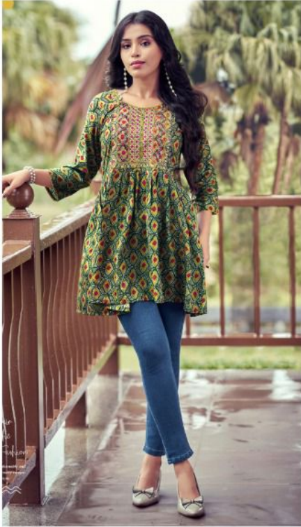
STYLE # 1001