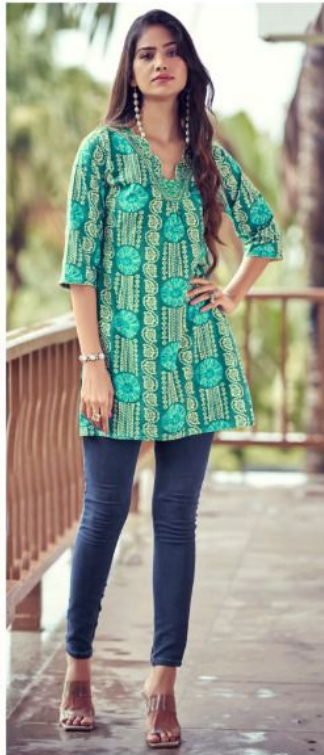
STYLE # 1006