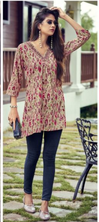
STYLE # 1007