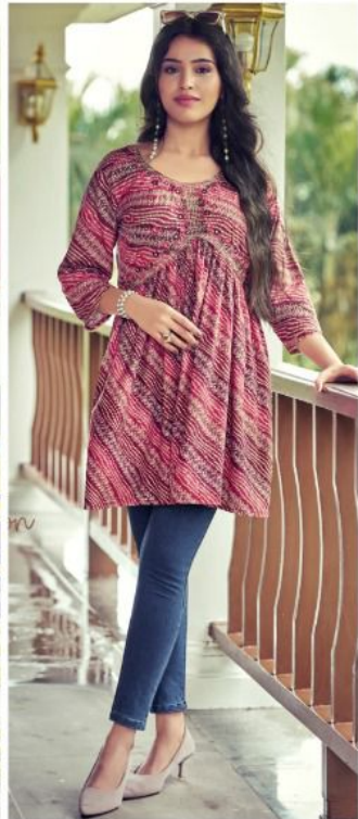
STYLE # 1005