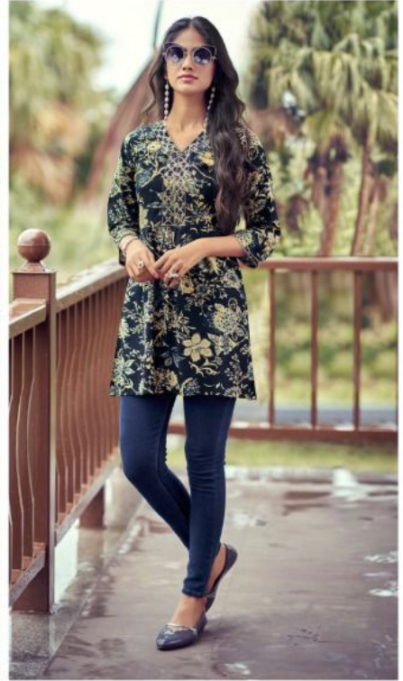
STYLE # 1003