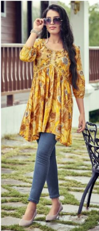
STYLE # 1004