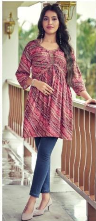
STYLE # 1005