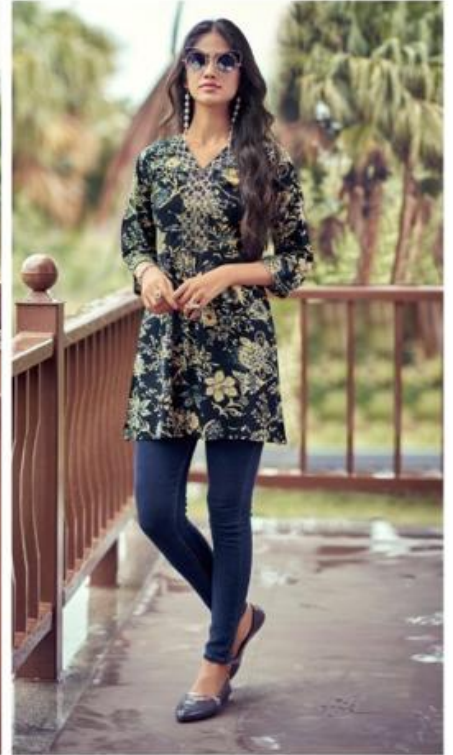
STYLE # 1003