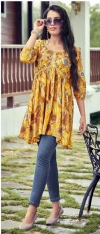
STYLE # 1004