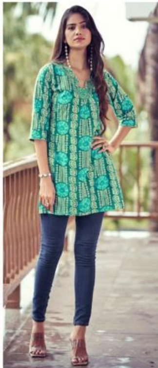
STYLE # 1006