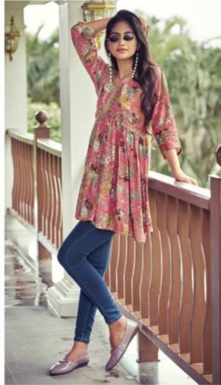
STYLE # 1002