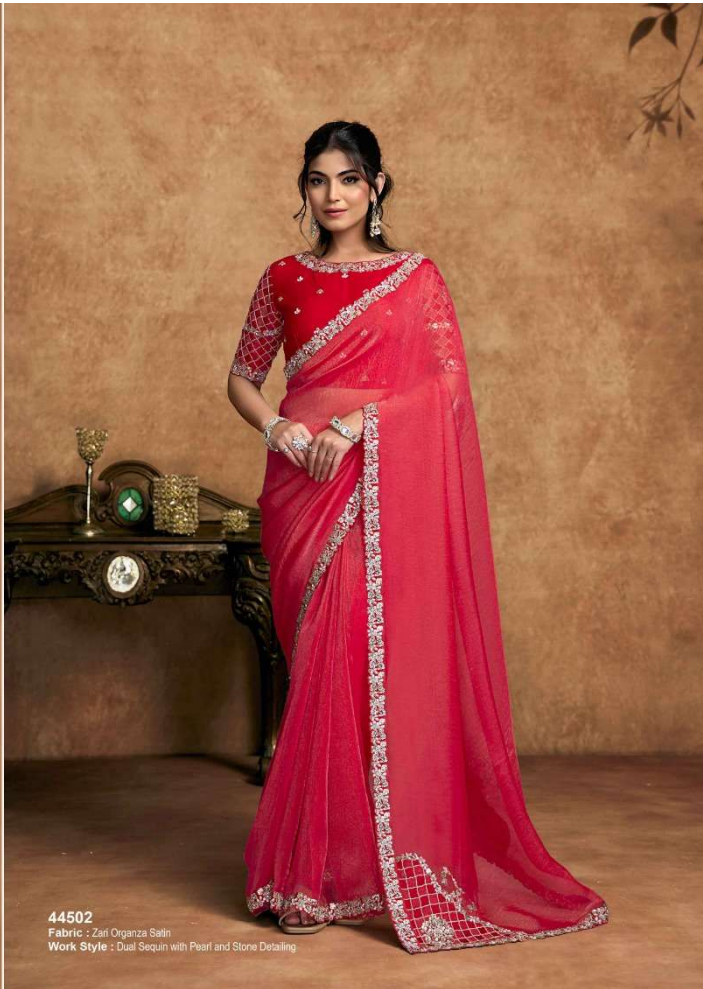
44502 Fabric : Zari Organza Satin Work Style : Dual Sequin with Pearl and Stone Detailing