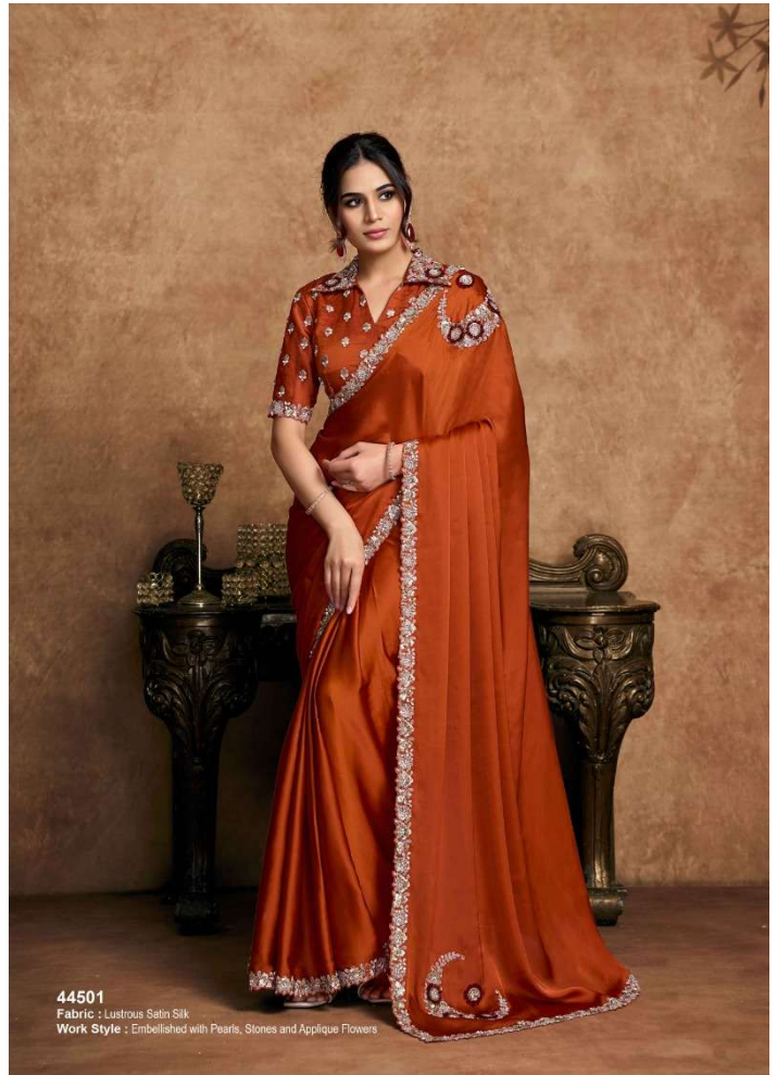
44501 Fabric : Lustrous Satin Silk Work Style : Embellished with Pearls, Stones and Applique Flowers