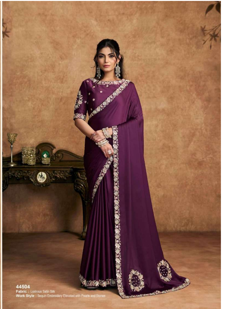
44504 Fabric : Lustrous Satin Silk Work Style : Sequin Embroidery Elevated with Pearls and Stones