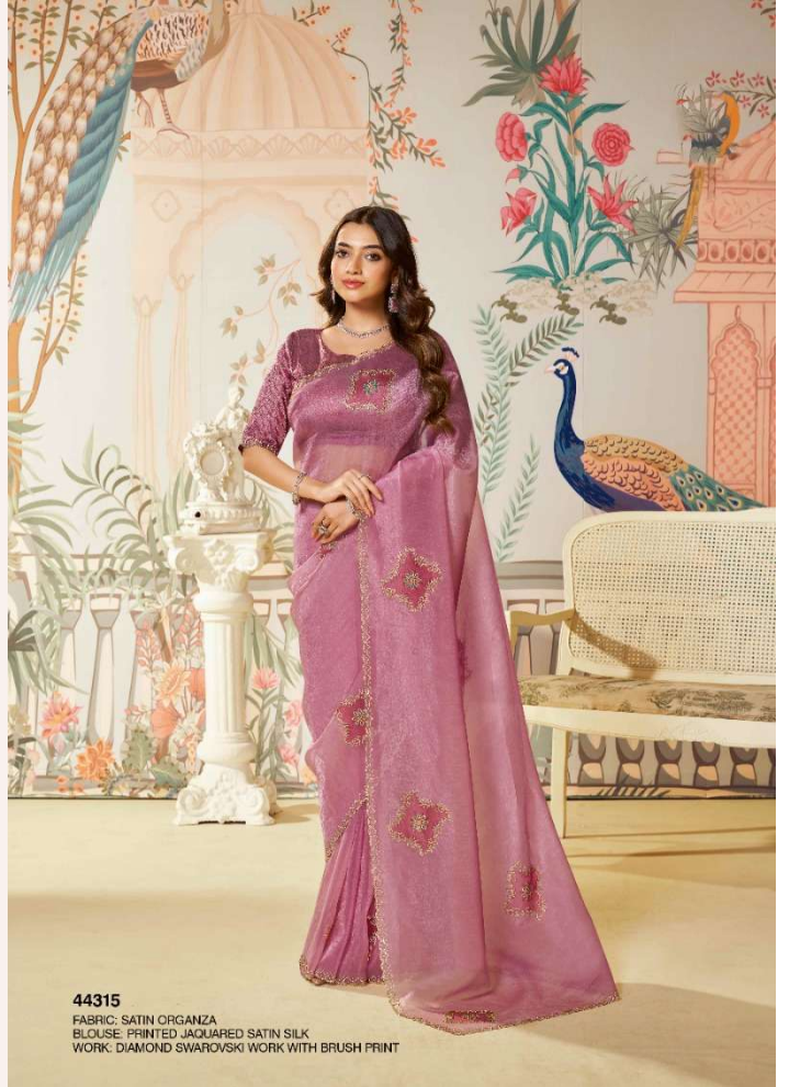
44315 FABRIC: SATIN ORGANZA BLOUSE: PRINTED JAQUARED SATIN SILK WORK: DIAMOND SWAROVSKI WORK WITH BRUSH PRINT