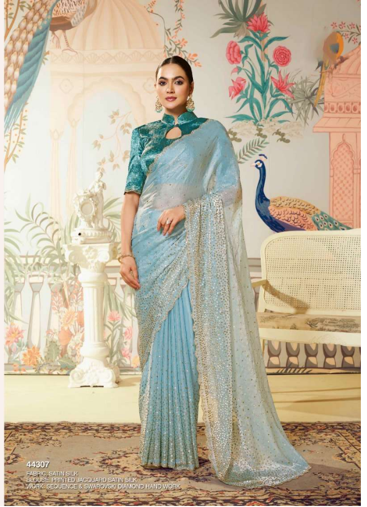
44307 FABRIC: SATIN SILK PATTERN: PRINTED JACQUARD SATIN SILK WORK: SEQUENCE & SWAROVSKI DIAMOND HAND WORK