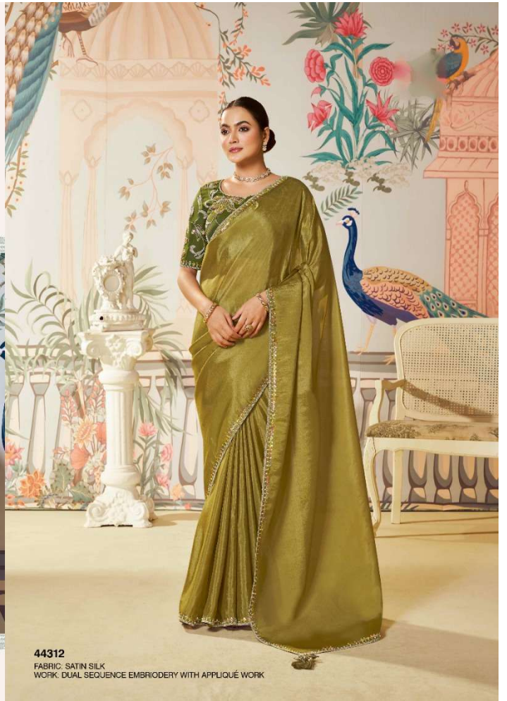
44312 FABRIC: SATIN SILK WORK: DUAL SEQUENCE EMBROIDERY WITH APPLIQUÉ WORK