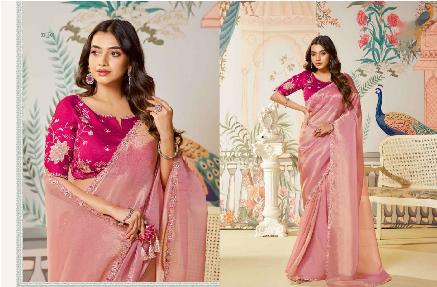
44308 FABRIC: ZARI ORGANZA SILK WORK: DUAL SEQUENCE EMBROIDERY WITH APPLIQUE WORK