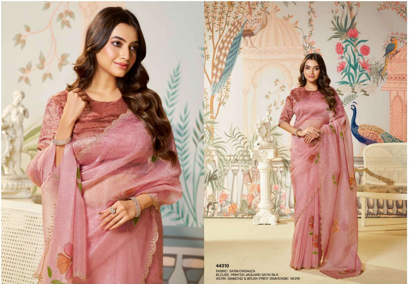
44310 FABRIC: SATIN ORGANZA BLOUSE: PRINTED JACQUARD SATIN SILK WORK: DIAMOND & BRUSH PRINT SWAROVSKI WORK