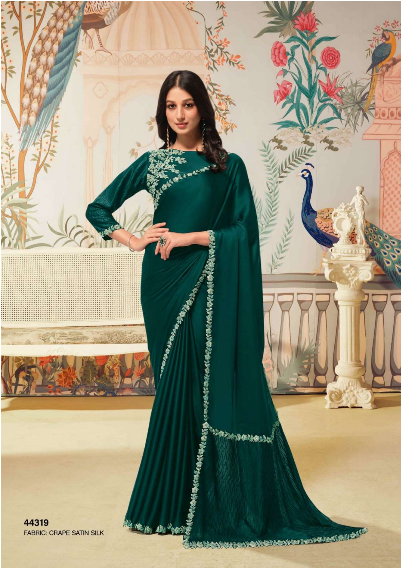
44319 FABRIC: CRAPE SATIN SILK