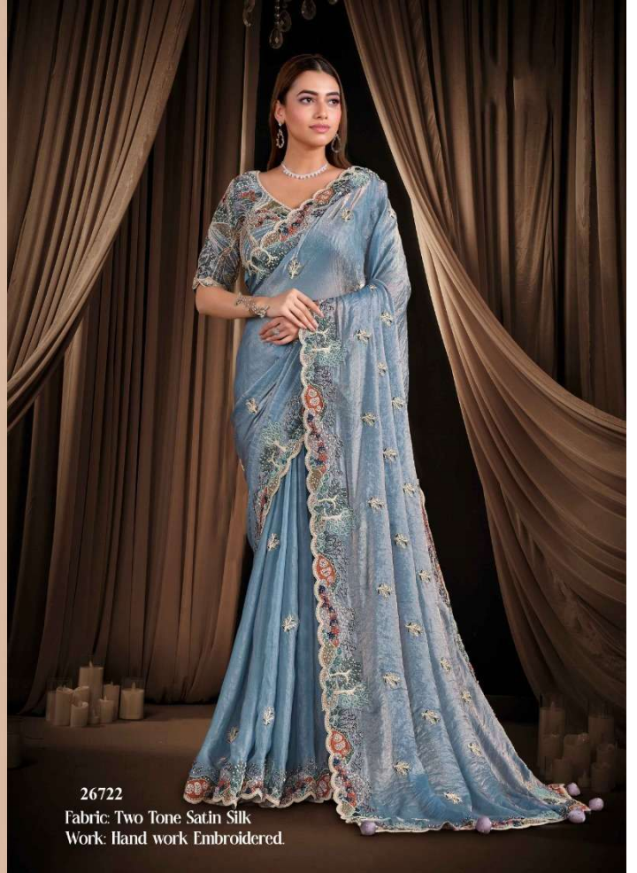
26722 Fabric: Two Tone Satin Silk Work: Hand work Embroidered.