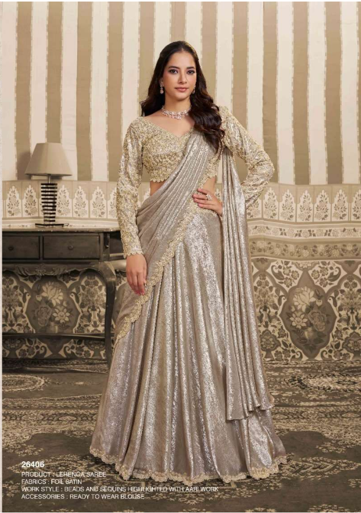
26406 PRODUCT : LEHENGA SAREE FABRICS : FOIL SATIN WORK STYLE : BEADS AND SEQUINS HIGHLIGHTED WITH AARL WORK ACCESSORIES : READY TO WEAR BLOUSE