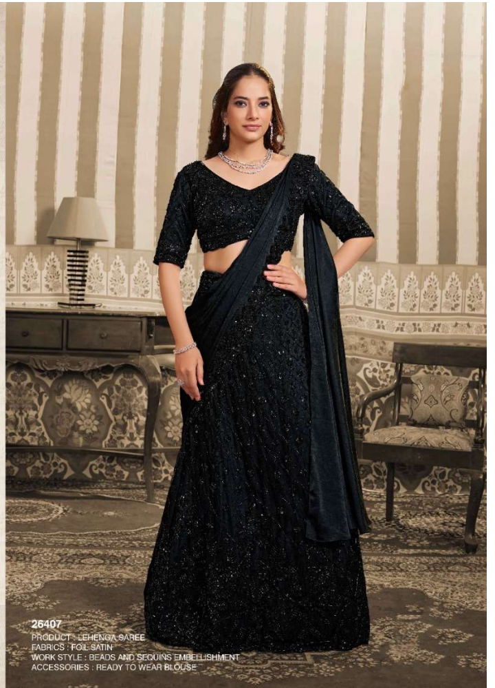
26407 PRODUCT : LEHENGA SAREE FABRICS : FOIL SATIN WORK STYLE : BEADS AND SEQUINS EMBELLISHMENT ACCESSORIES : READY TO WEAR BLOUSE