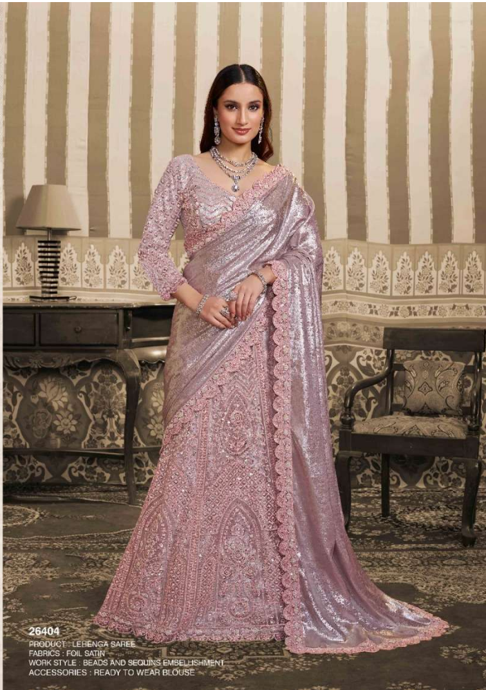
26404 PRODUCT : LEHENGA SAREE FABRICS : FOIL SATIN WORK STYLE : BEADS AND SEQUINS EMBELLISHMENT ACCESSORIES : READY TO WEAR BLOUSE