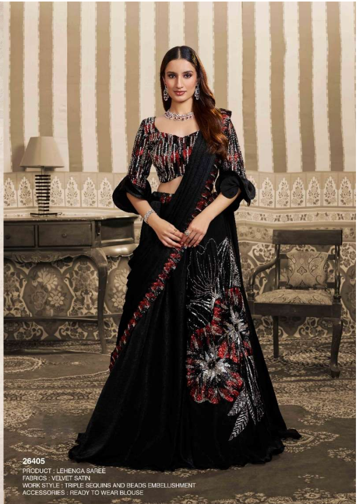
26405 PRODUCT : LEHENGA SAREE FABRICS : VELVET SATIN WORK STYLE : TRIPLE SEQUINS AND BEADS EMBELLISHMENT ACCESSORIES : READY TO WEAR BLOUSE