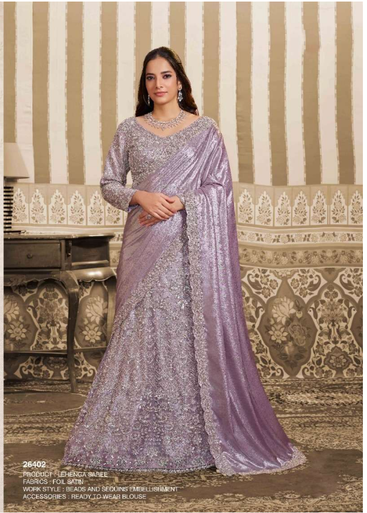
26402 PRODUCT : LEHENGA SAREE FABRICS : FOIL SATIN WORK STYLE : BEADS AND SEQUINS EMBELLISHMENT ACCESSORIES : READY TO WEAR BLOUSE