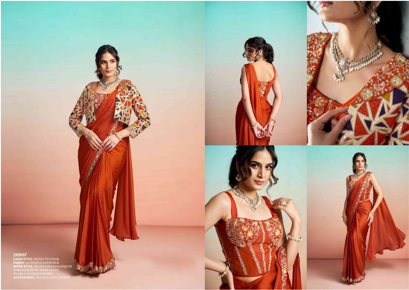
26907 SAREE STYLE : READY TO WEAR FABRIC : LUSTROUS SATIN SILK WORK STYLE : MULTI THREAD & SEQUIN EMBELLISHMENT WITH STONE, PEARL & APPLIQUE WORK ACCESSORIES : BLOUSE, BELT, JACKET