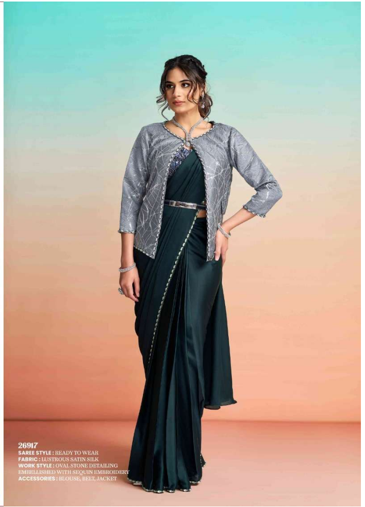
26917 SAREE STYLE : READY TO WEAR FABRIC : LUSTROUS SATIN SILK WORK STYLE : OVAL STONE DETAILING EMBELLISHED WITH SEQUIN EMBROIDERY ACCESSORIES : BLOUSE, BELT, JACKET