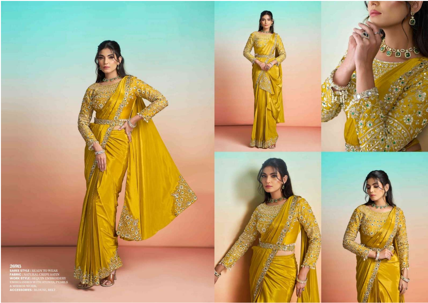
26913 SAREE STYLE : READY TO WEAR FABRIC : NATURAL CREPE SATIN WORK STYLE : SEQUIN EMBROIDERY EMBELLISHED WITH STONES, PEARLS & MIRROR WORK. ACCESSORIES : BLOUSE, BELT