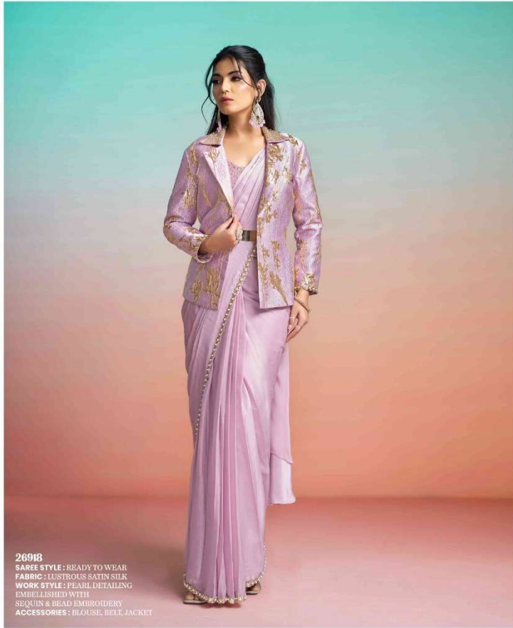
26918 SAREE STYLE: READY TO WEAR FABRIC: LUSTROUS SATIN SILK WORK STYLE: PEARL DETAILING EMBELLISHED WITH SEQUIN & BEAD EMBROIDERY ACCESSORIES: BLOUSE, BELT, JACKET