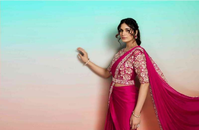
26914 SAREE STYLE : READY TO WEAR FABRIC : LUSTROUS SATIN SILK WORK STYLE : FLORAL SEQUIN EMBROIDERY WITH STONE & PEARL WORK ACCESSORIES : BLOUSE, BELT