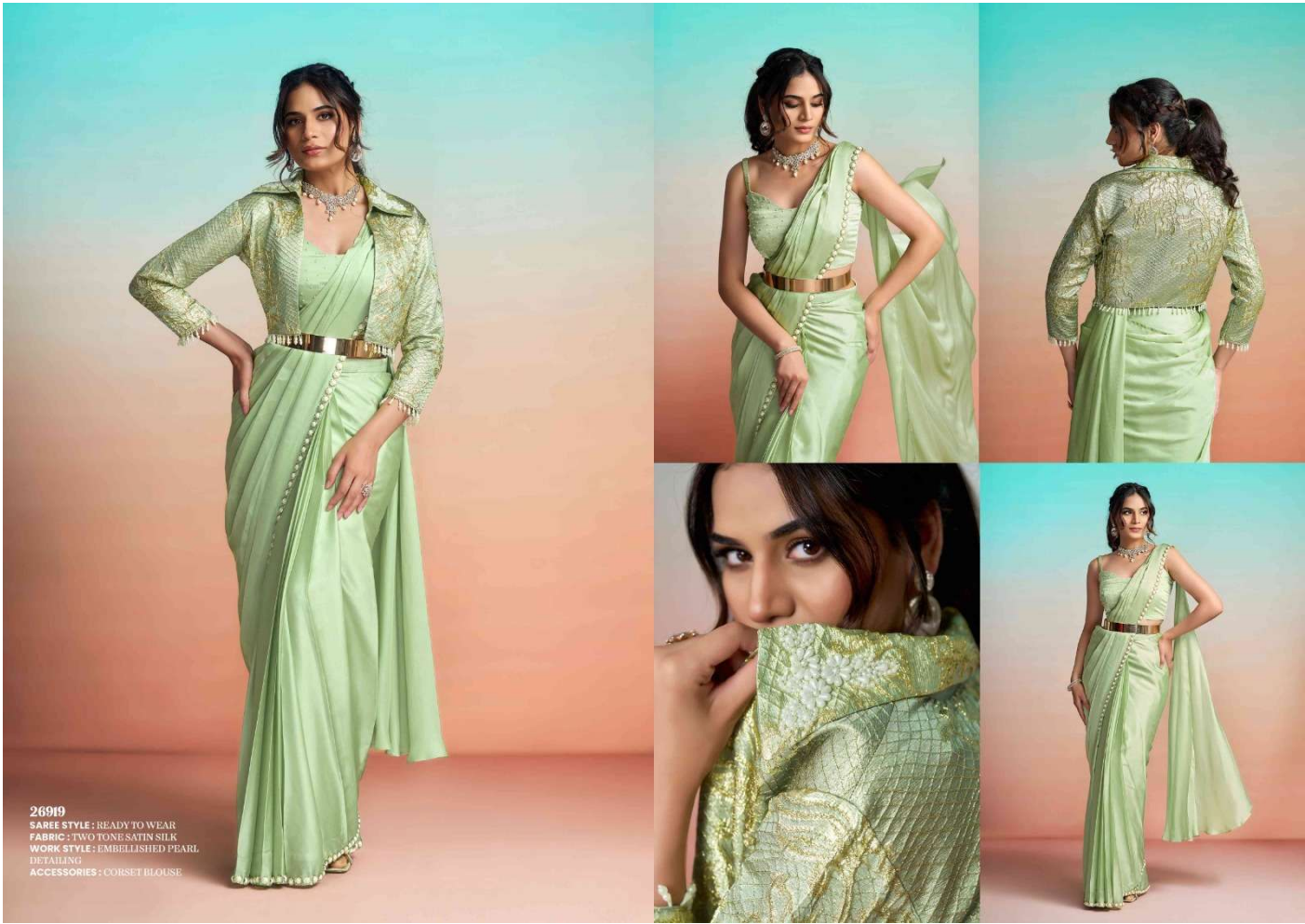
26919 SAREE STYLE : READY TO WEAR FABRIC : TWO TONE SATIN SILK WORK STYLE : EMBELLISHED PEARL DETAILING ACCESSORIES : CORSET BLOUSE