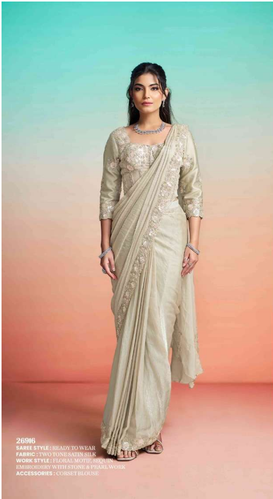
26916 SAREE STYLE : READY TO WEAR FABRIC : TWO TONE SATIN SILK WORK STYLE : FLORAL MOTIF, SEQUIN EMBROIDERY WITH STONE & PEARL WORK ACCESSORIES : CORSET BLOUSE