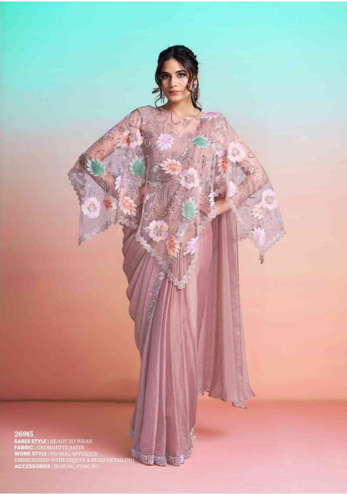
26915 SAREE STYLE : READY TO WEAR FABRIC : GEORGETTE SATIN WORK STYLE : FLORAL APPLIQUE EMBROIDDED WITH SEQUIN & BEAD DETAILING ACCESSORIES : BLOUSE, PONCHO