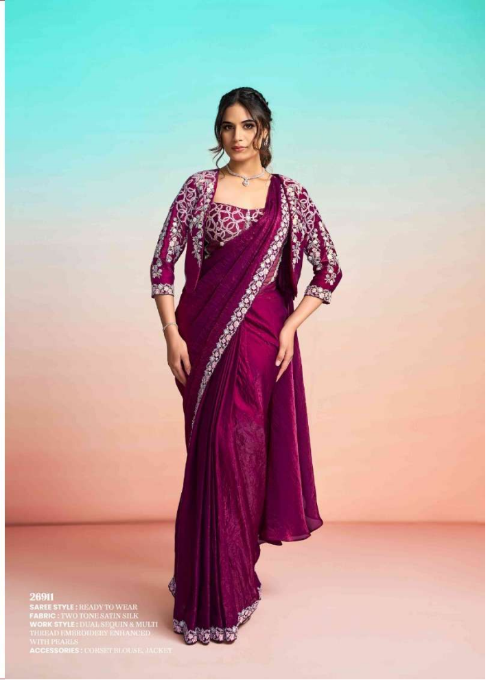
269H SAREE STYLE : READY TO WEAR FABRIC : TWO TONE SATIN SILK WORK STYLE : DUAL SEQUIN & MULTI THREAD EMBROIDERY ENHANCED WITH PEARLS ACCESSORIES : CORSET BLOUSE, JACKIE