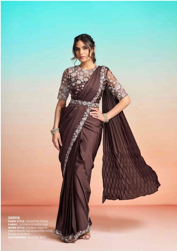
26906 SAREE STYLE : READY TO WEAR FABRIC : LUSTROUS SATIN SILK WORK STYLE : FLORAL SEQUIN EMBROIDERY HIGHLIGHTED WITH PEARL & STONES ACCESSORIES : BLOUSE, BELT