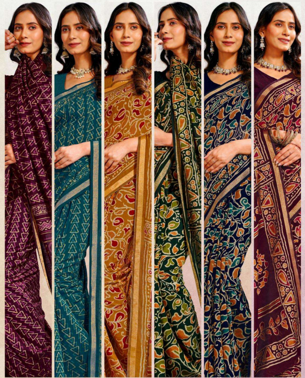
78002C 78002D 78003A 78003B 78003C 78003D