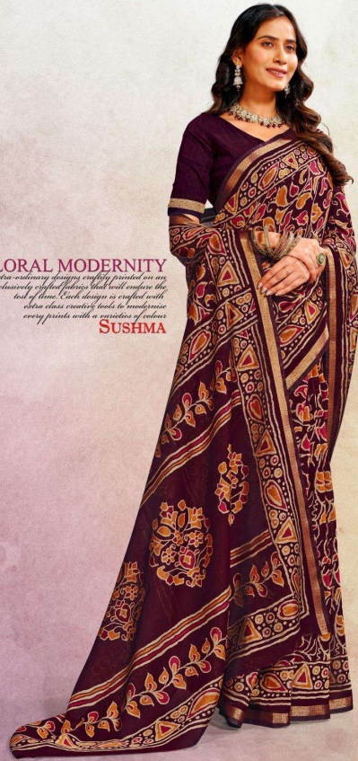
FLORAL MODERNITY Extra-ordinary designs crafted printed on an exclusively original fabric that will capture the best of time. Each design is crafted with extra class creativity, leads to modernize every female with a variation of ideas SUSHMA