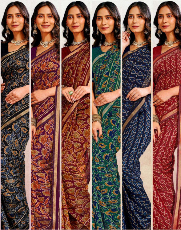
78001A 78001B 78001C 78001D 78002A 78002B