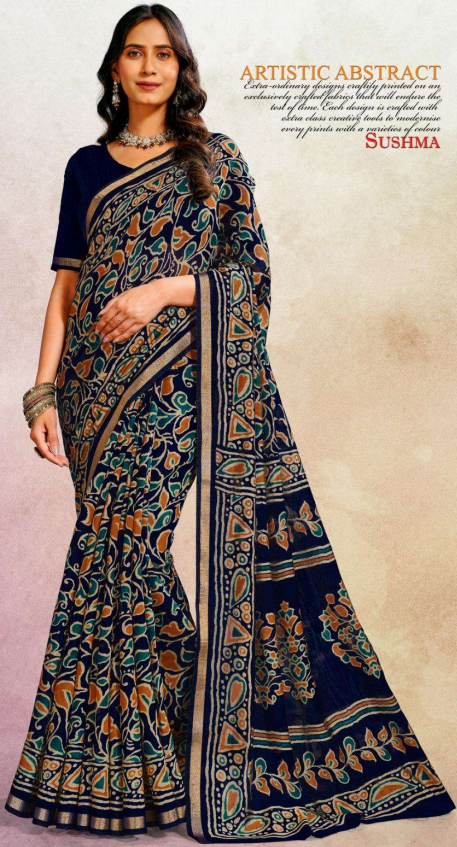
ARTISTIC ABSTRACT Extra-ordinary designs crafted printed on an exclusively original fabric that will capture the best of time. Each design is crafted with extra class creativity, leads to modernize every female with a variation of ideas SUSHMA