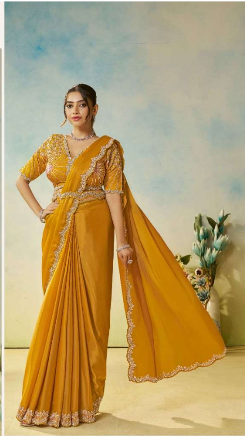
15702 FABRIC: SOFT SATIN SILK WORK STYLE: DUAL SEQUENCE EMBROIDERY WITH MULTI STONE HANDWORK. ACCESSORIES: BELT WITH FANCY PALLU.