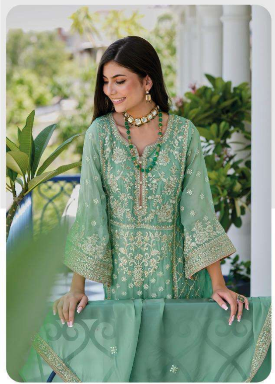
FALL Of grace 1594