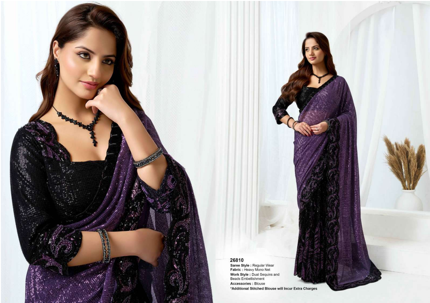
26810 Saree Style : Regular Wear Fabric : Heavy Mono Net Work Style : Dual Sequins and Beads Embellishment Accessories : Blouse *Additional Stitched Blouse will Incur Extra Charges