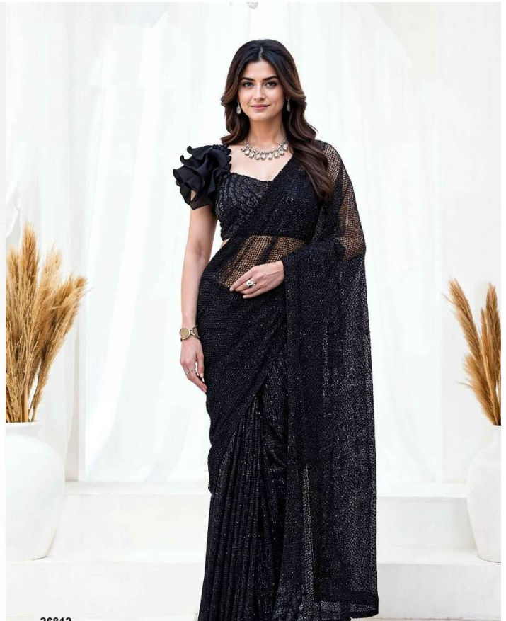
26812 Saree Style : Ready to Wear Fabric : Heavy Mono Net With Beads Work Style : Beads Handwork Accessories : Blouse *Additional Stitched Blouse will Incur Extra Charges