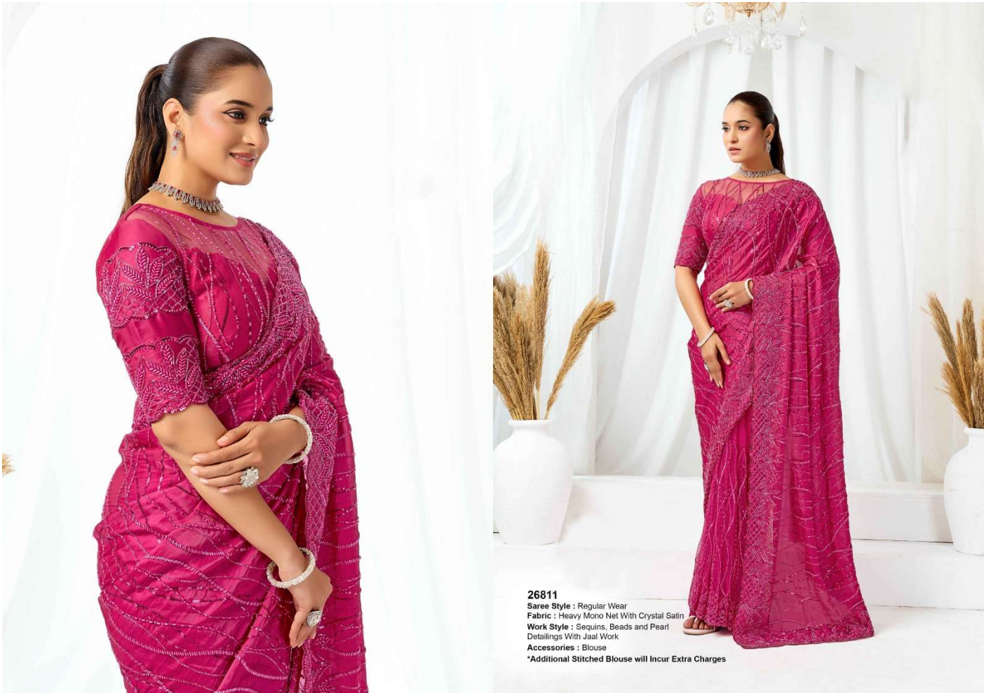
26811 Saree Style : Regular Wear Fabric : Heavy Mono Net With Crystal Satin Work Style : Sequins, Beads and Pearl Detailings With Jaal Work Accessories : Blouse *Additional Stitched Blouse will Incur Extra Charges