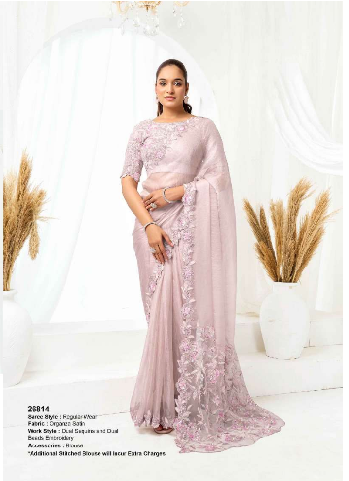
26814 Saree Style : Regular Wear Fabric : Organza Satin Work Style : Dual Sequins and Dual Beads Embroidery Accessories : Blouse *Additional Stitched Blouse will Incur Extra Charges