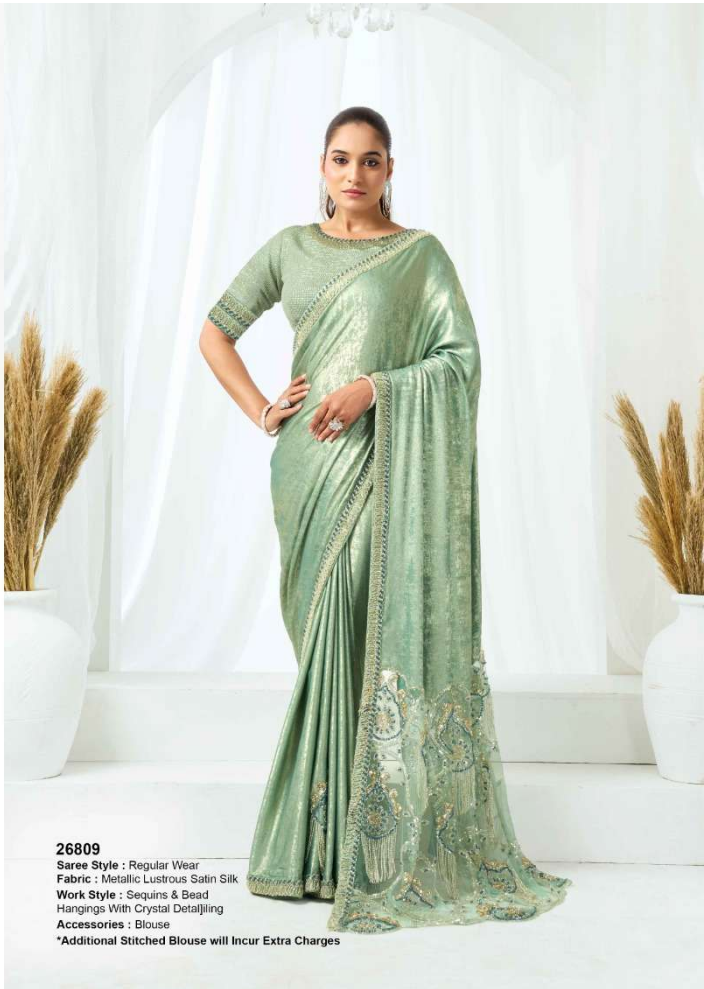
26809 Saree Style : Regular Wear Fabric : Metallic Lustrous Satin Silk Work Style : Sequins & Bead Hangings With Crystal Detailing Accessories : Blouse *Additional Stitched Blouse will Incur Extra Charges