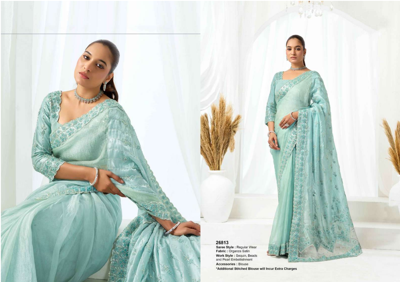
26813 Saree Style : Regular Wear Fabric : Organza Satin Work Style : Sequin, Beads and Pearl Embellishment Accessories : Blouse *Additional Stitched Blouse will Incur Extra Charges