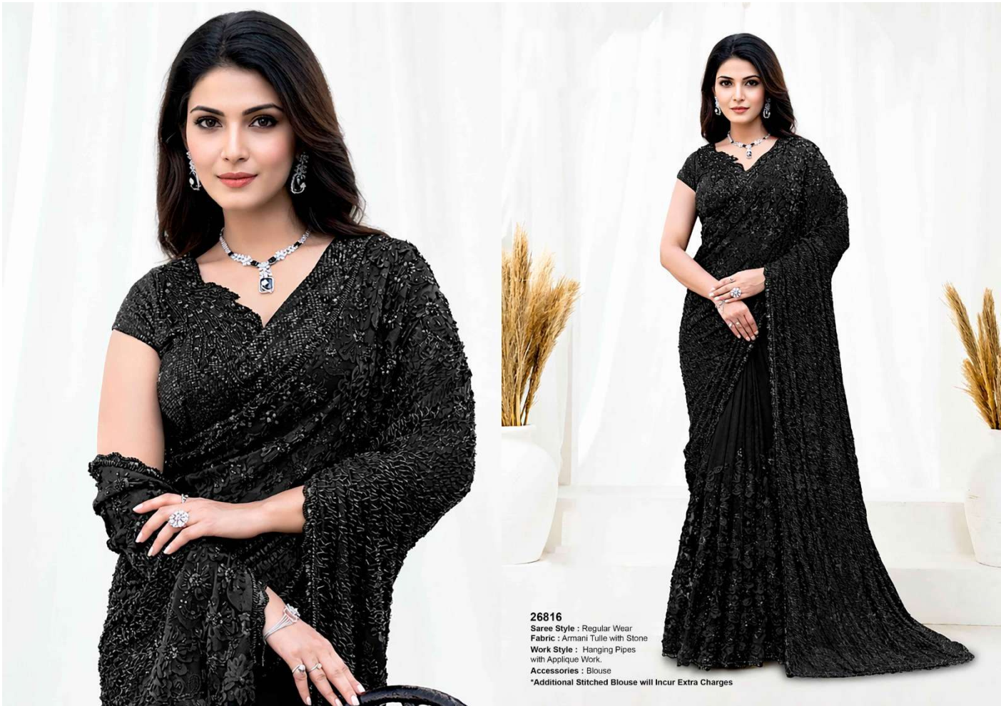
26816 Saree Style : Regular Wear Fabric : Armani Tulle with Stone Work Style : Hanging Pipes with Applique Work. Accessories : Blouse *Additional Stitched Blouse will Incur Extra Charges