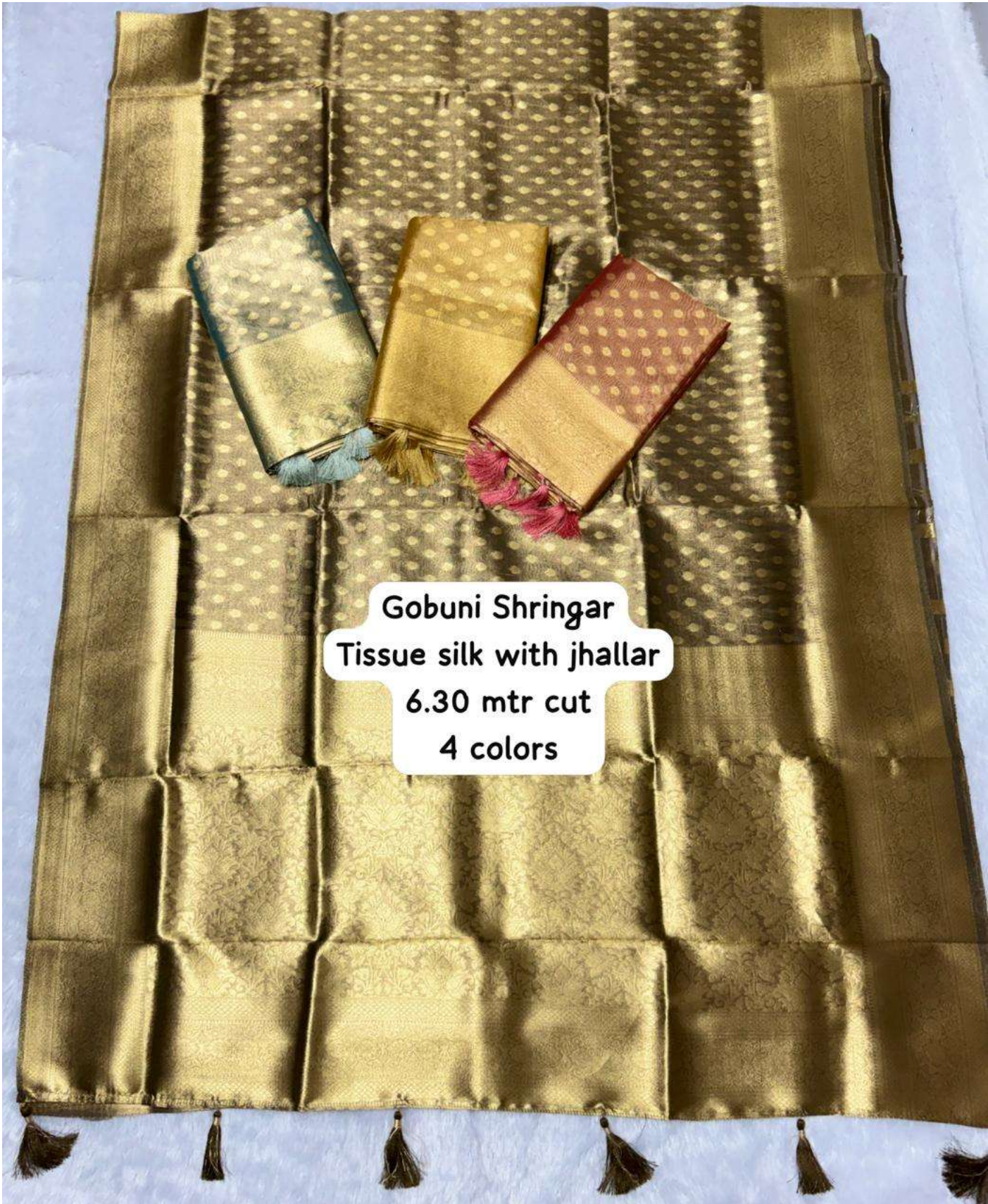
Gobuni Shringar Tissue silk with jhallar 6.30 mtr cut 4 colors