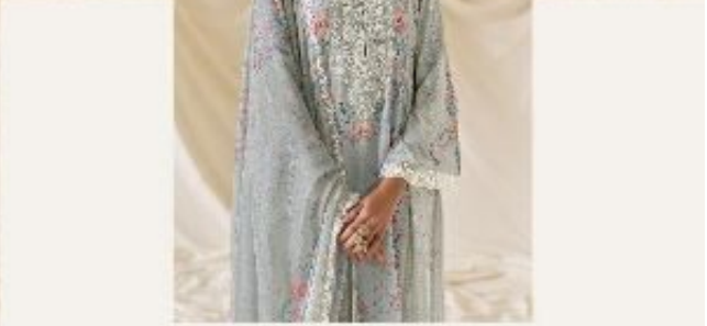
كافتان بلون أزرق فاتح مزينة بالخرز والفضة الرقم: 8442