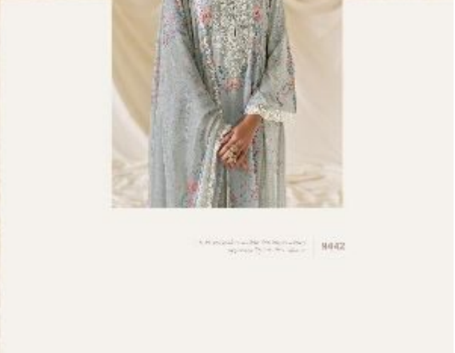
كافتان بلون أزرق فاتح مزينة بالخرز والبرص اللون الأزرق الفاتح 8442