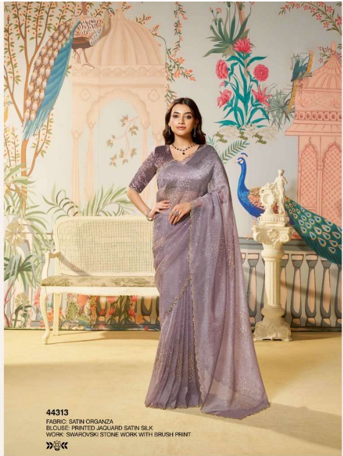
44313 FABRIC: SATIN ORGANZA BLOUSE: PRINTED JACQUARD SATIN SILK WORK: SWAROVSKI STONE WORK WITH BRUSH PRINT »»»