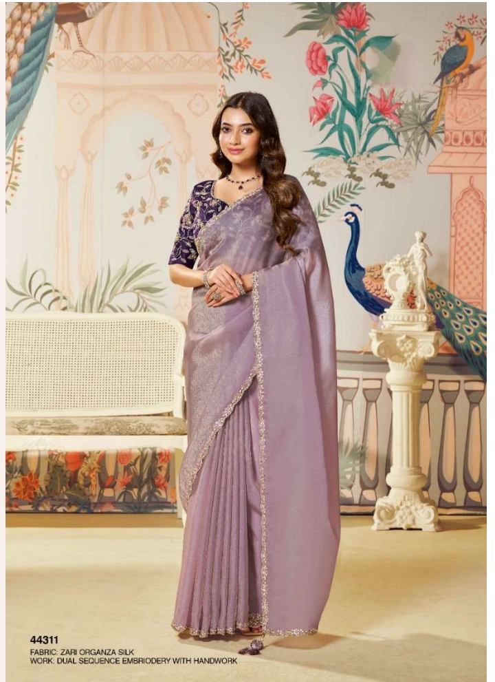
44311 FABRIC: ZARI ORGANZA SILK WORK: DUAL SEQUENCE EMBROIDERY WITH HANDWORK