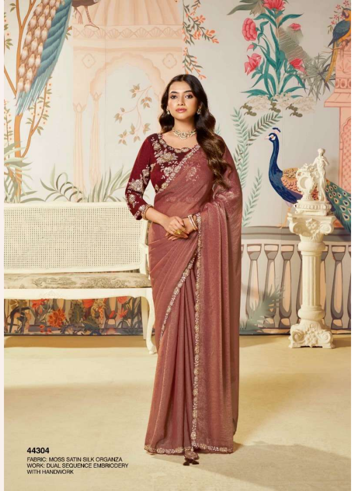
44304 FABRIC: MOSS SATIN SILK ORGANZA WORK: DUAL SEQUENCE EMBROIDERY WITH HANDWORK