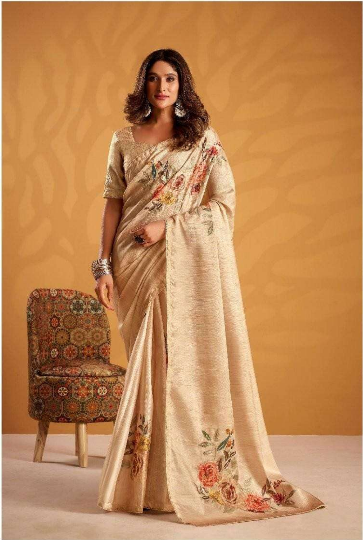
TT-1006 Clean lines and simple borders that say less, mean more.