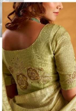
Soft as moonlight, fluid as dawn, crafted to gracefully embrace your form celebrating femininity without compromise.