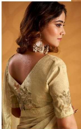
Preserving legacy with contemporary attitude the perfect drape for every generation.