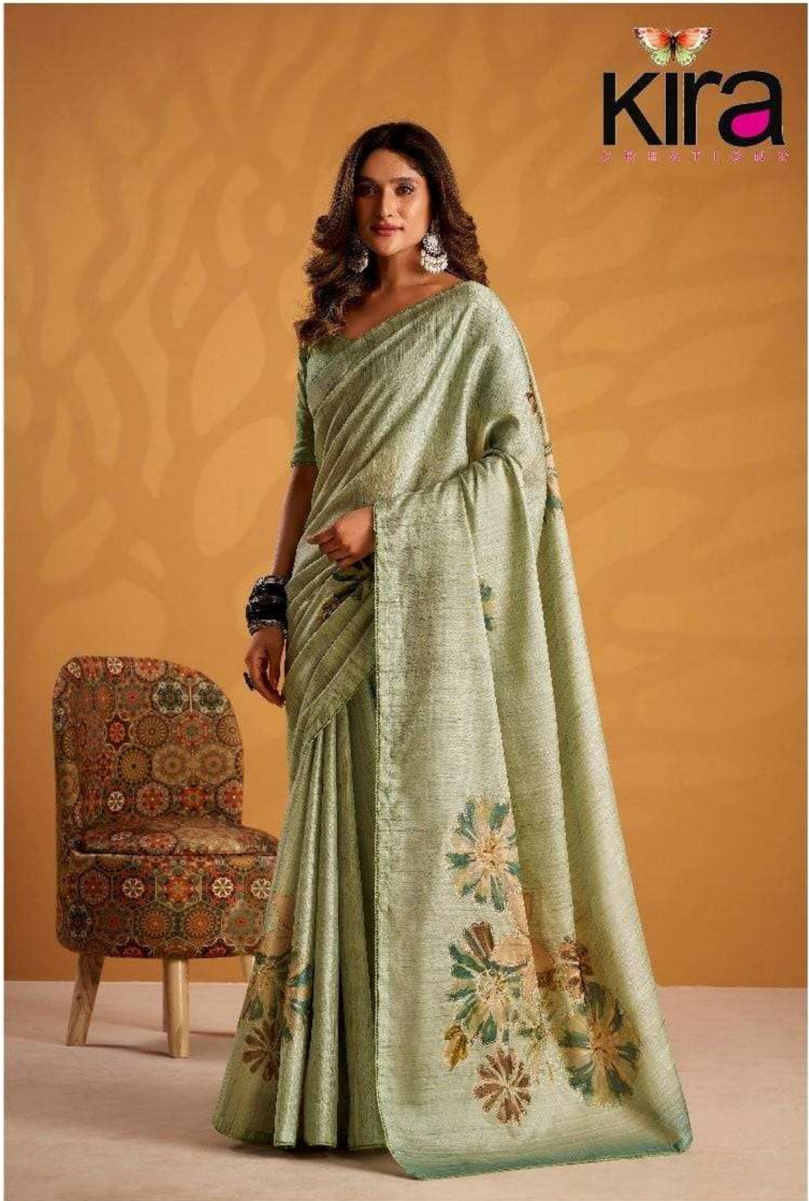
Deep hues with subtle shimmer for after dark elegance. TT-1003