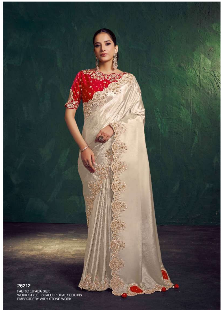
26212 FABRIC : UPADA SILK WORK STYLE : SCALLOP DUAL SEQUINS EMBROIDERY WITH STONE WORK