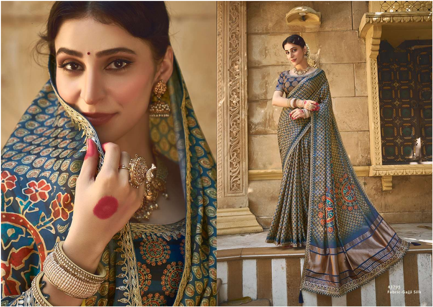
43705 Fabric-Gajji Silk