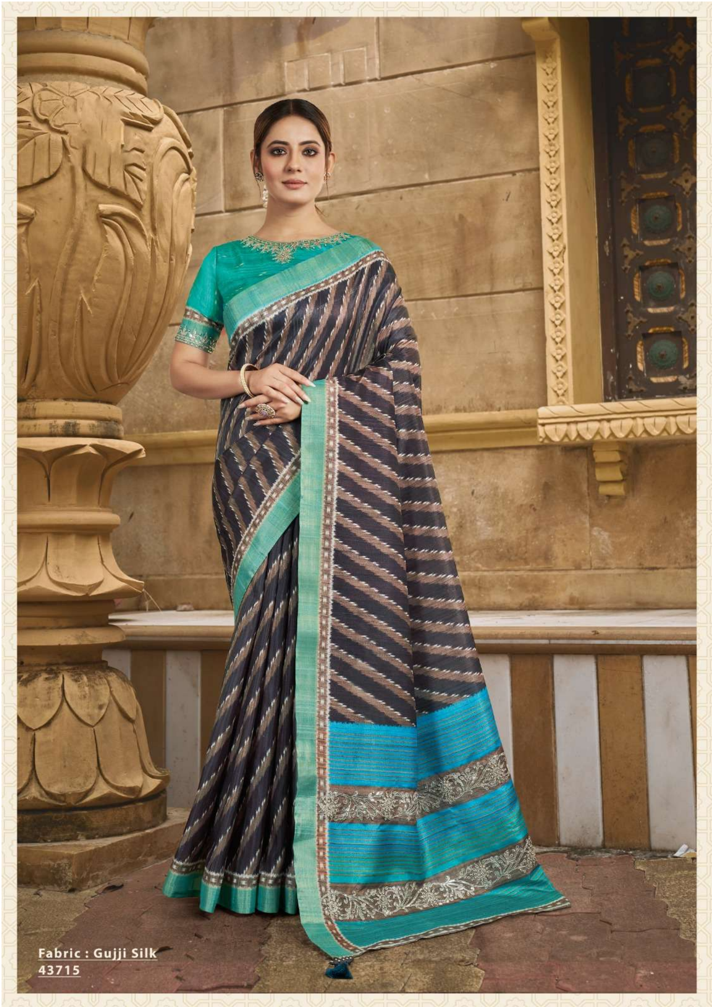
Fabric : Gujji Silk 43715