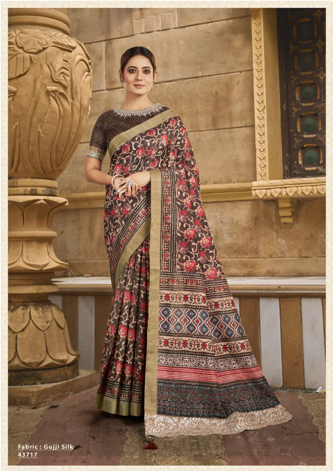
Fabric : Gujji Silk 43717