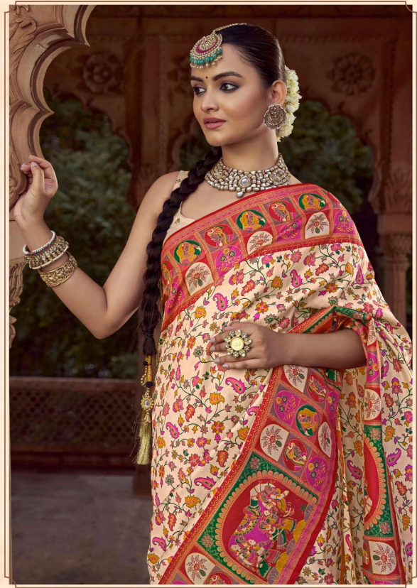
IVORY BASE BLOOMS WITH HERITAGE K 7073 ART AND FESTIVE PINK BORDERS.