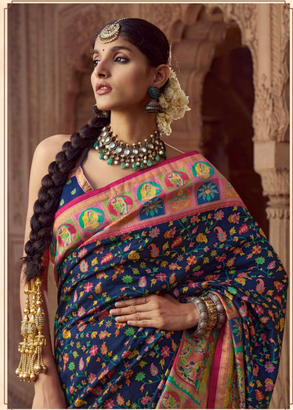
DEEP BLUE CANVAS BLOOMS WITH K 7074 FLORALS AND HERITAGE BORDERS.