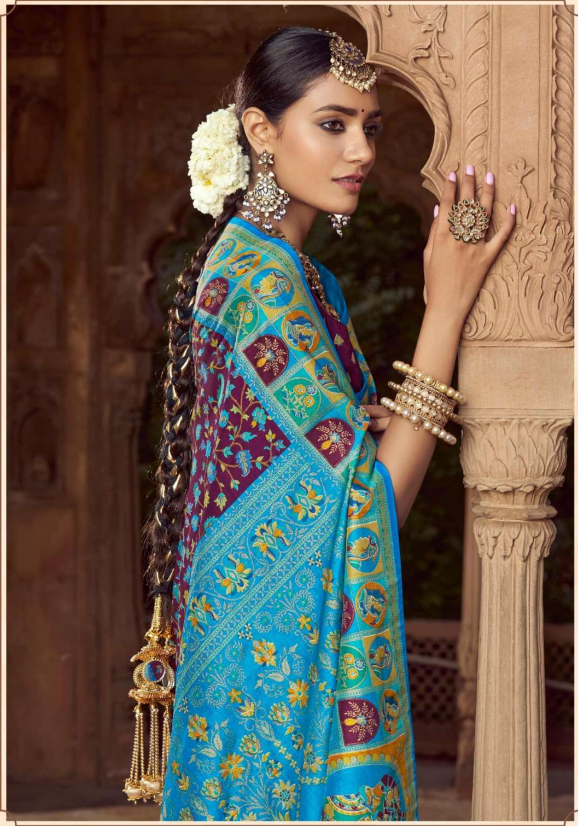
ROYAL BLUE AND PLUM UNITE K 7072 IN A TAPESTRY OF TRADITION.