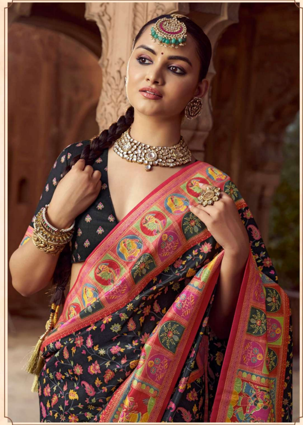
BLACK BLOOMS WITH FLORALS, K 7069 FRAMED BY A VIBRANT PALLU.