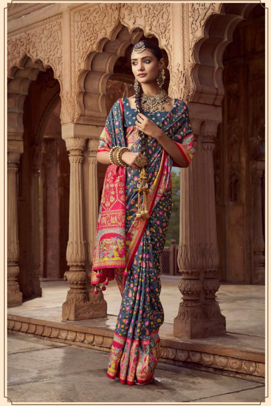
GOLDEN MOTIFS ON MIDNIGHT K 7067 BLUE WITH A ROYAL PALLU.