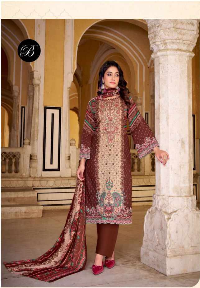
920-008 Ethnic indian couture that defines poise and charisma at its best.