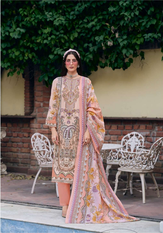
I MAKE CLOTHES, WOMEN MAKE FASHION 929 - 005