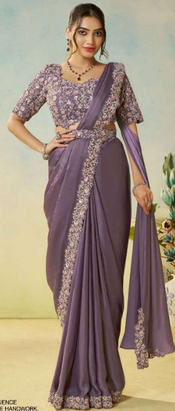
25703 FABRIC: SOFT SATIN SILK WORK STYLE: DUAL SEQUENCE EMBROIDERY WITH STONE HANDWORK. ACCESSORIES: BELT WITH FANCY A-LINE PALLU.