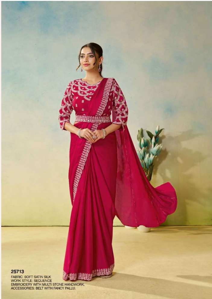
25713 FABRIC: SOFT SATIN SILK WORK STYLE: SEQUENCE EMBROIDERY WITH MULTI STONE HANDWORK. ACCESSORIES: BELT WITH FANCY PALLU.