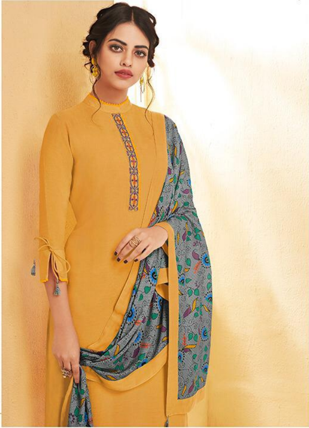
THE ECCENTRICS-Giving a whole new meaning to tradition with our remarkable designs.