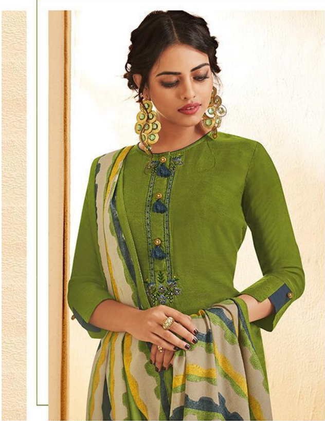
MAGNIFICENT LOOK- Be beautiful with this magnetic look design and colorful collection. *3503*