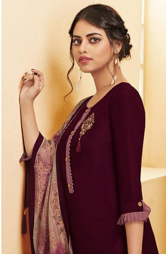
LAVISHING CLOSET - feel the lavishness in all beautiful closets & feel special in every occasion.