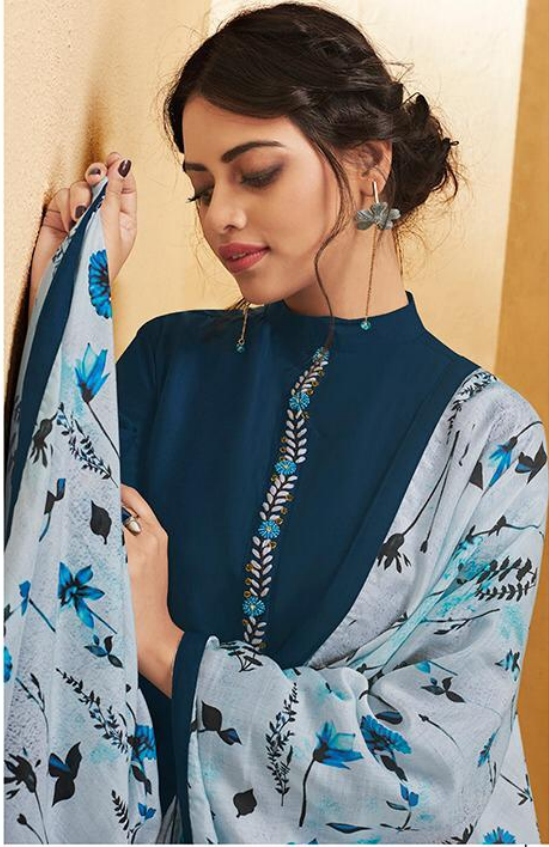
RAVISHING CHIC – Bloom around with ravishing suits in the colour of purity love and chic.