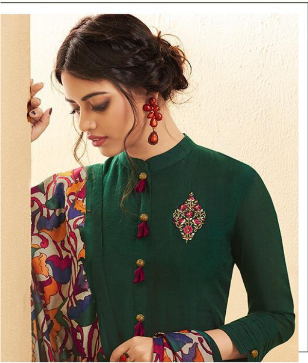
DAZZLING DIVA- Shine like divas on the here, Its a time to shine.