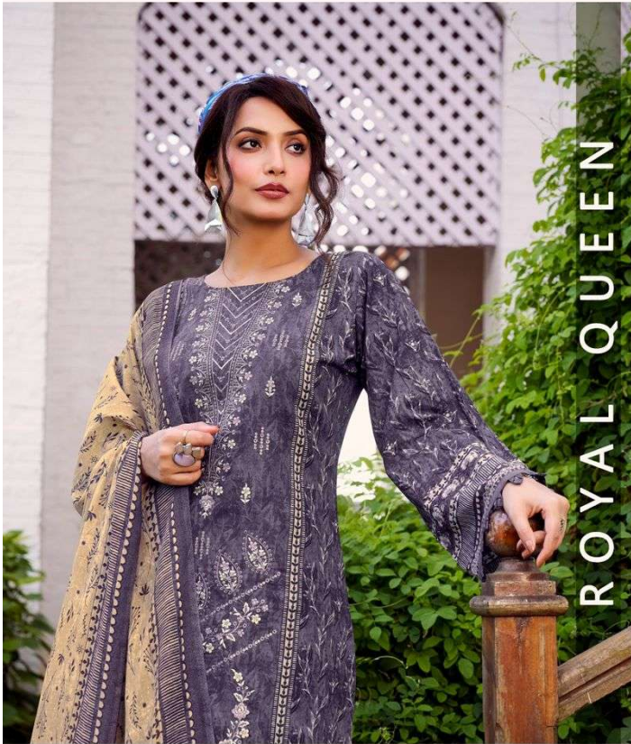
909-006 when we chose to take inspiration from Indian beauty the result is the result is here a set of vivid colorful design told a story about fashion.