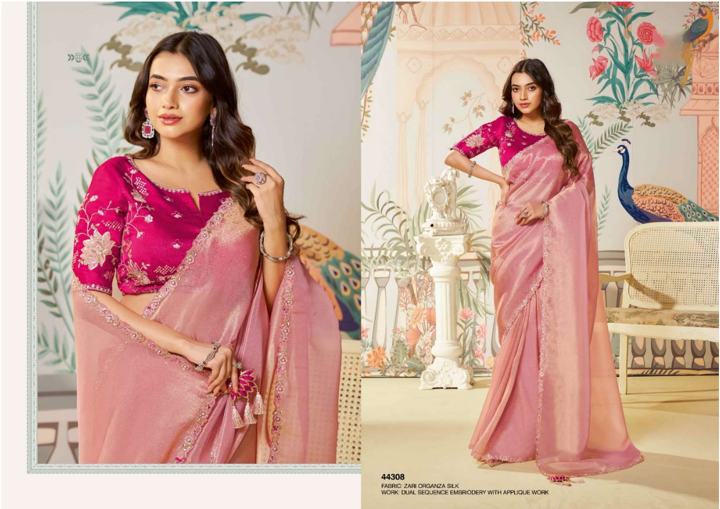
44308 FABRIC: ZARI ORGANZA SILK WORK: DUAL SEQUENCE EMBROIDERY WITH APPLIQUE WORK