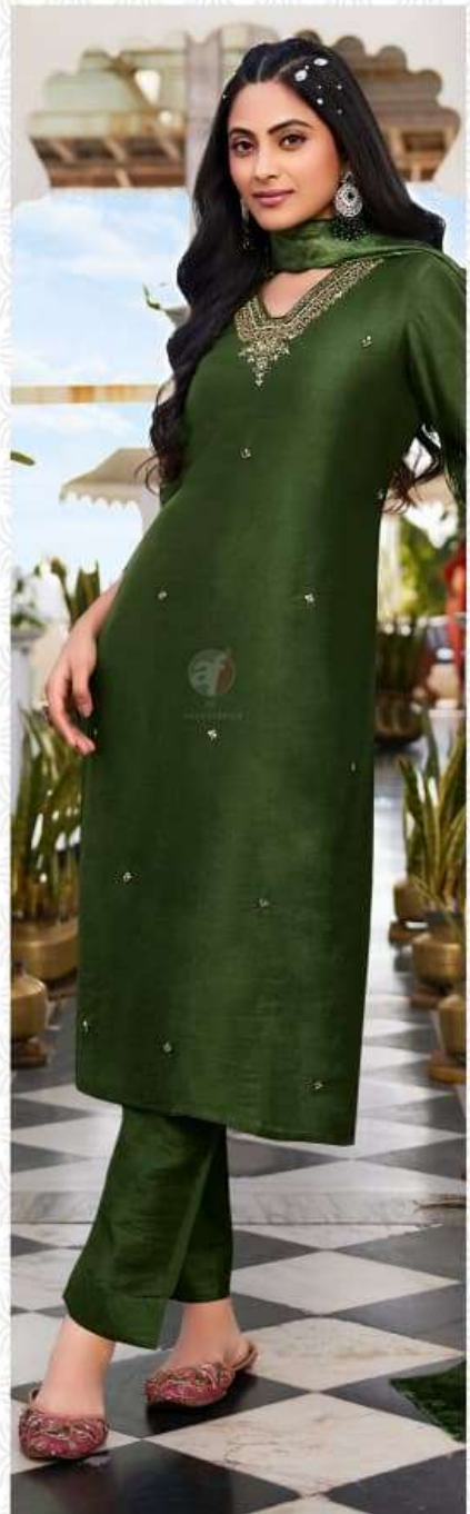
NAKHRALI VOL-6 4133