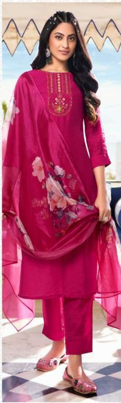
NAKHRALI VOL-6 4135