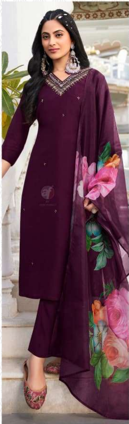
NAKHRALI VOL-6 4131