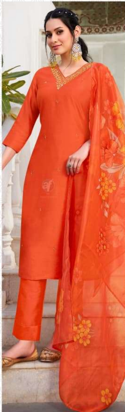
NAKHRALI VOL-6 4132