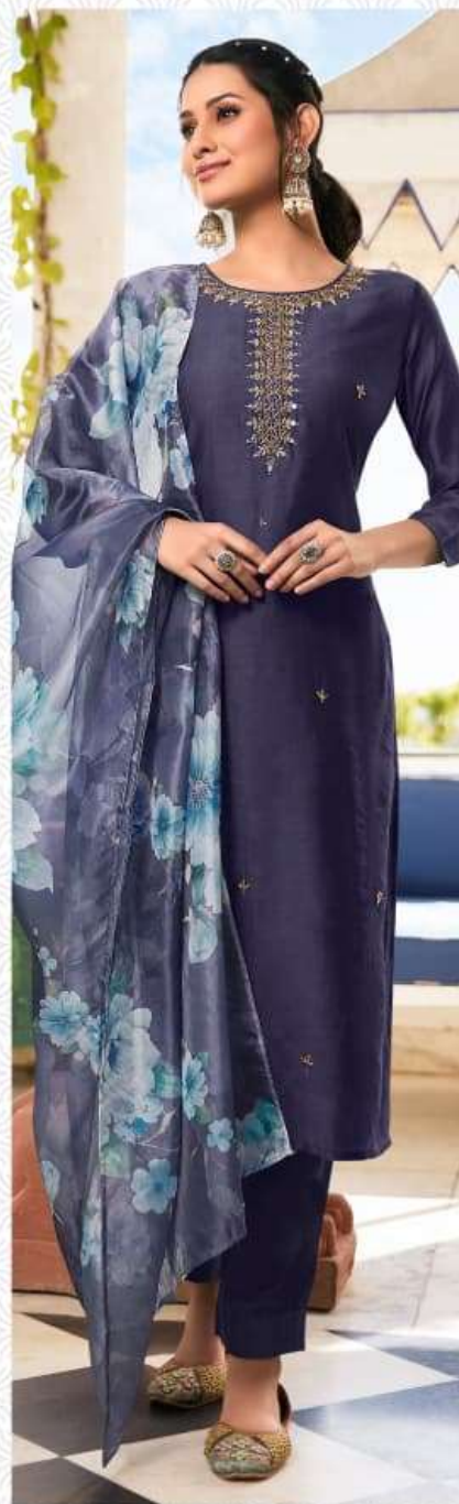
NAKHRALI VOL-6 4136