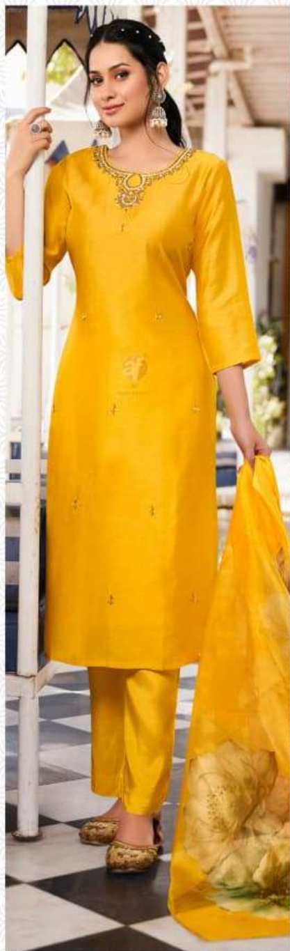
NAKHRALI VOL-6 4134