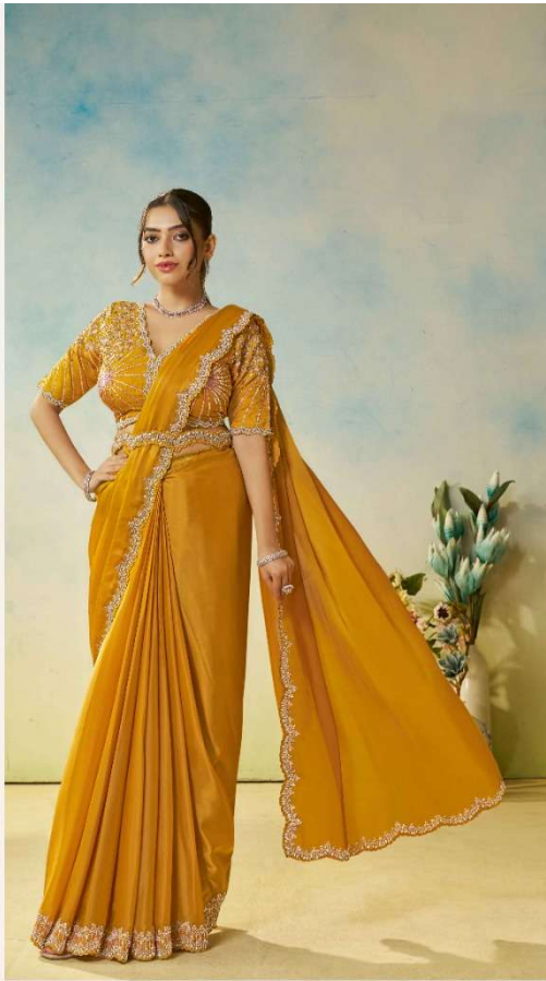
25702 FABRIC: SOFT SATIN SILK WORK STYLE: DUAL SEQUENCE EMBROIDERY WITH MULTI STONE HANDWORK. ACCESSORIES: BELT WITH FANCY PALLU.