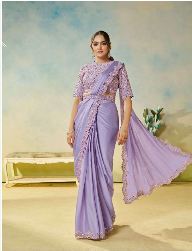
25708 FABRIC: SOFT SATIN SILK WORK STYLE: EMBROIDERY WITH MIRROR & STONE HANDWORK. ACCESSORIES: BELT WITH STRAIGHT FANCY PALLU.