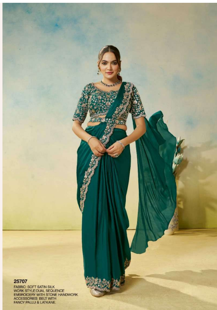
25707 FABRIC: SOFT SATIN SILK WORK STYLE: DUAL SEQUENCE EMBROIDERY WITH STONE HANDWORK. ACCESSORIES: BELT WITH FANCY PALLU & LATKANE.