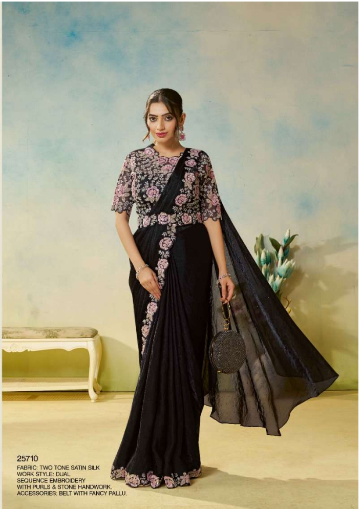
25710 FABRIC: TWO TONE SATIN SILK WORK STYLE: DUAL SEQUENCE EMBROIDERY WITH PURLS & STONE HANDWORK. ACCESSORIES: BELT WITH FANCY PALLU.