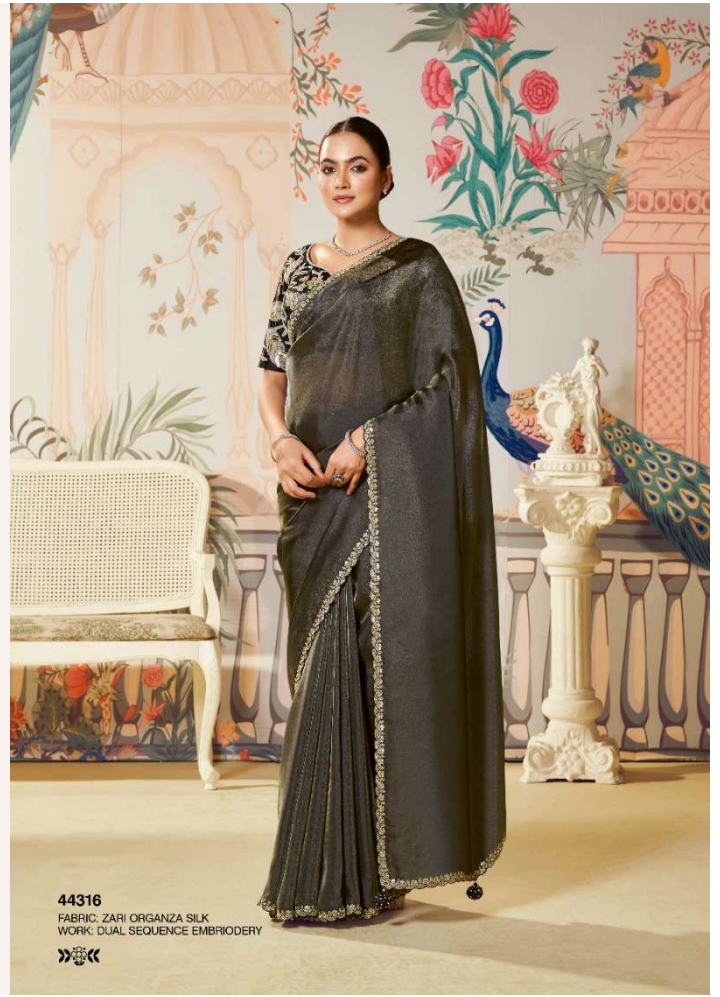
44316 FABRIC: ZARI ORGANZA SILK WORK: DUAL SEQUENCE EMBROIDERY »»««