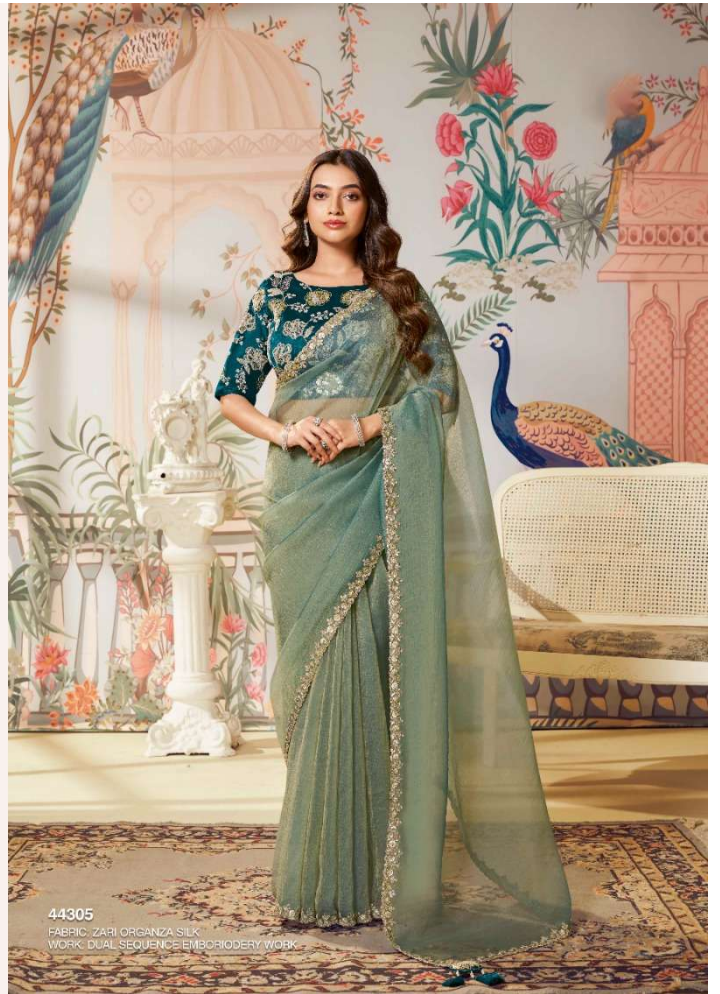
44305 FABRIC: ZARI ORGANZA SILK WORK: DUAL SEQUENCE EMBROIDERY WORK