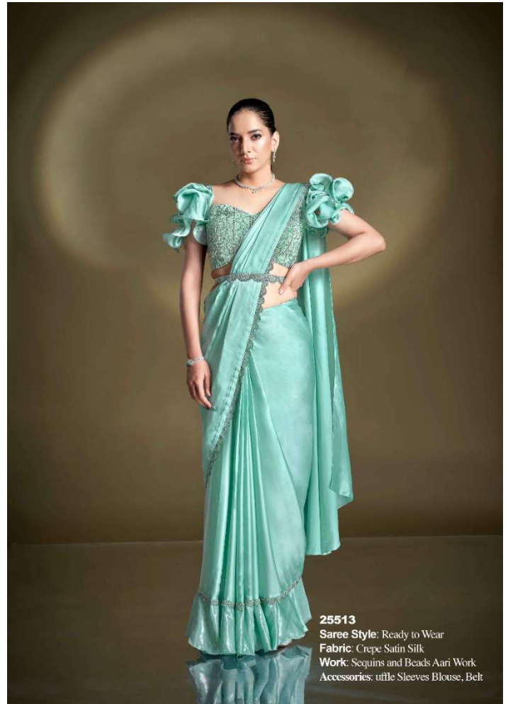
25513 Saree Style: Ready to Wear Fabric: Crepe Satin Silk Work: Sequins and Beads Aari Work Accessories: tulle Sleeves Blouse, Belt