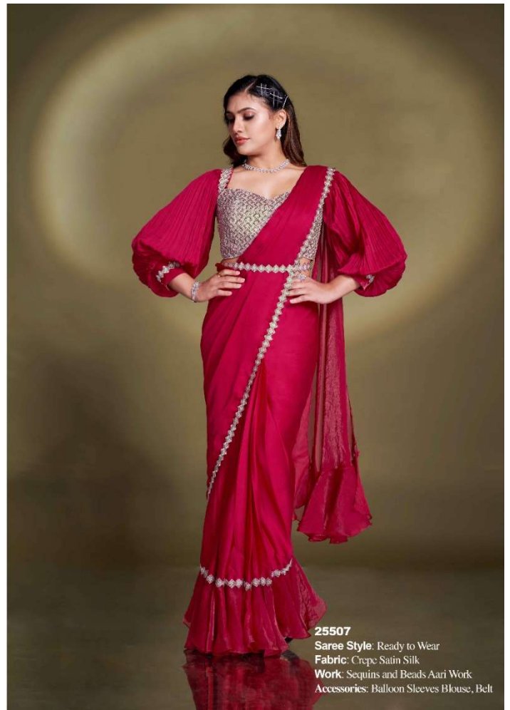
25507 Saree Style: Ready to Wear Fabric: Crepe Satin Silk Work: Sequins and Beads Aari Work Accessories: Balloon Sleeves Blouse, Belt