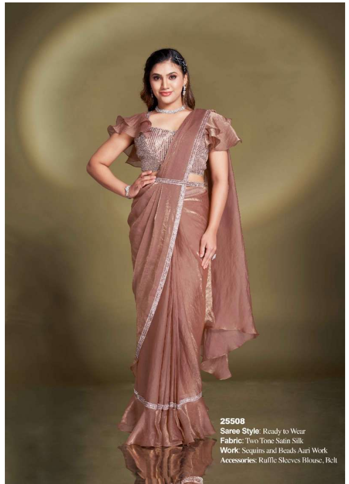
25508 Saree Style: Ready to Wear Fabric: Two Tone Satin Silk Work: Sequins and Beads Aari Work Accessories: Ruffle Sleeves Blouse, Belt