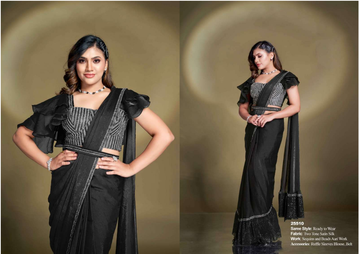
25510 Saree Style: Ready to Wear Fabric: Two Tone Satin Silk Work: Sequins and Beads Aari Work Accessories: Ruffle Sleeves Blouse, Belt