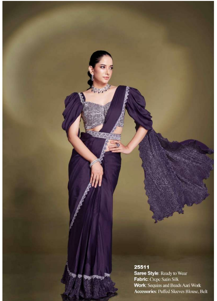
25511 Saree Style: Ready to Wear Fabric: Crepe Satin Silk Work: Sequins and Beads Aari Work Accessories: Puffed Sleeves Blouse, Belt