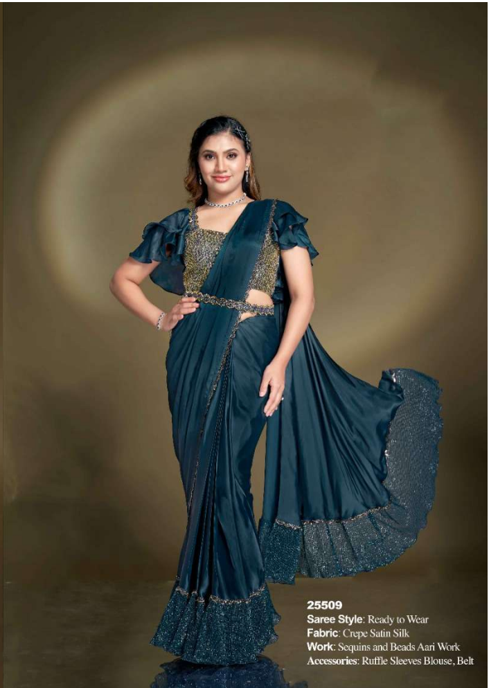
25509 Saree Style: Ready to Wear Fabric: Crepe Satin Silk Work: Sequins and Beads Aari Work Accessories: Ruffle Sleeves Blouse, Belt