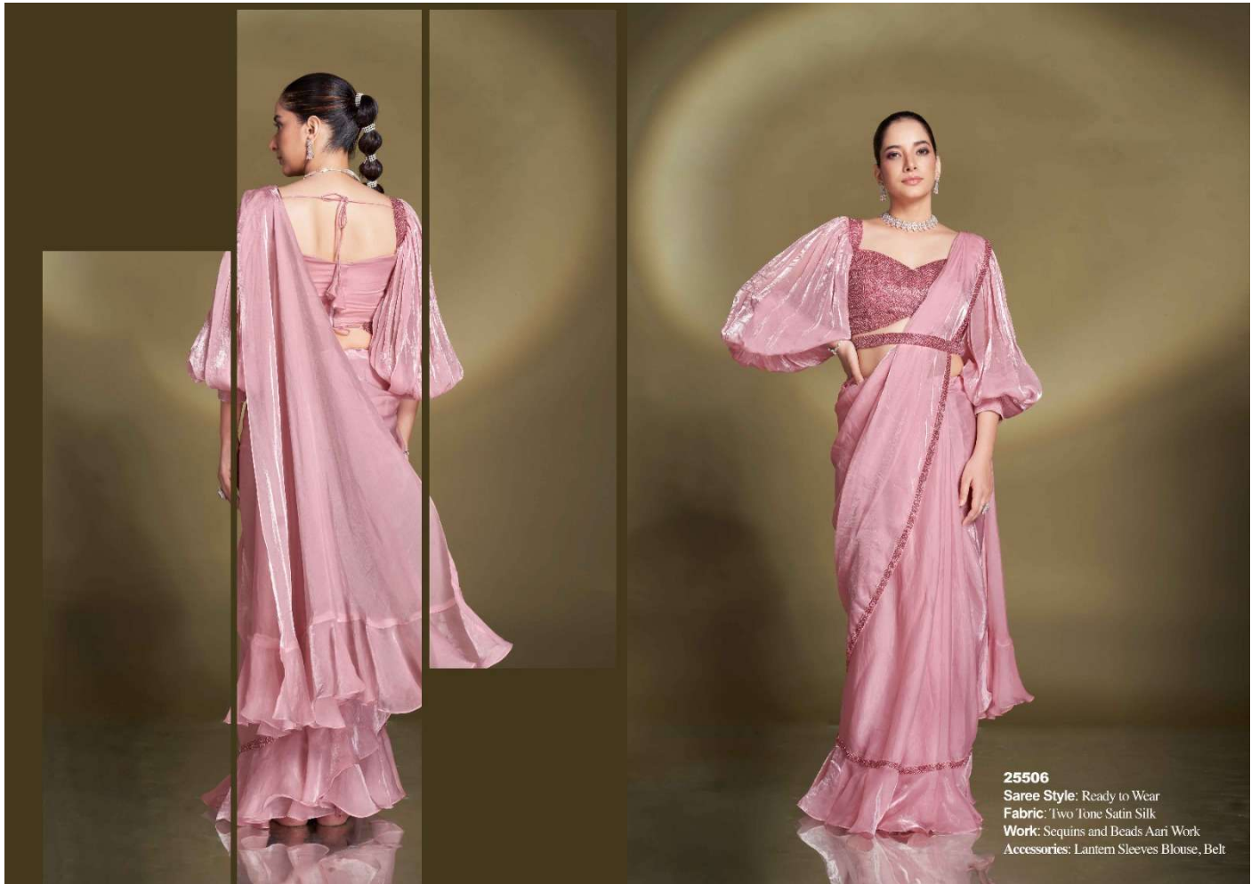
25506 Saree Style: Ready to Wear Fabric: Two Tone Satin Silk Work: Sequins and Beads Aari Work Accessories: Lantern Sleeves Blouse, Belt