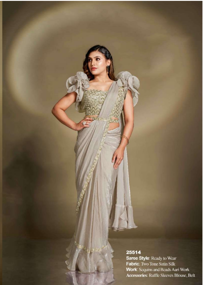
25514 Saree Style: Ready to Wear Fabric: Two Tone Satin Silk Work: Sequins and Beads Aari Work Accessories: Ruffle Sleeves Blouse, Belt