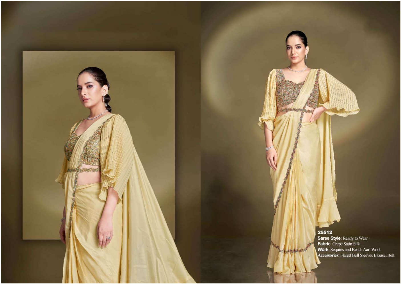
25512 Saree Style: Ready to Wear Fabric: Crepe Satin Silk Work: Sequins and Beads Aari Work Accessories: Flared Bell Sleeves Blouse, Belt