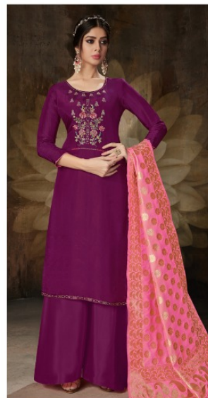
* 2004 *