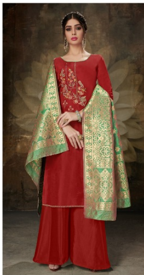
* 2001 *