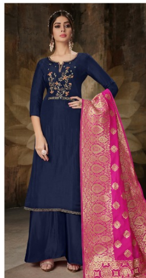
* 2003 *