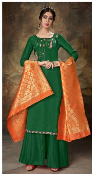
* 2002 *