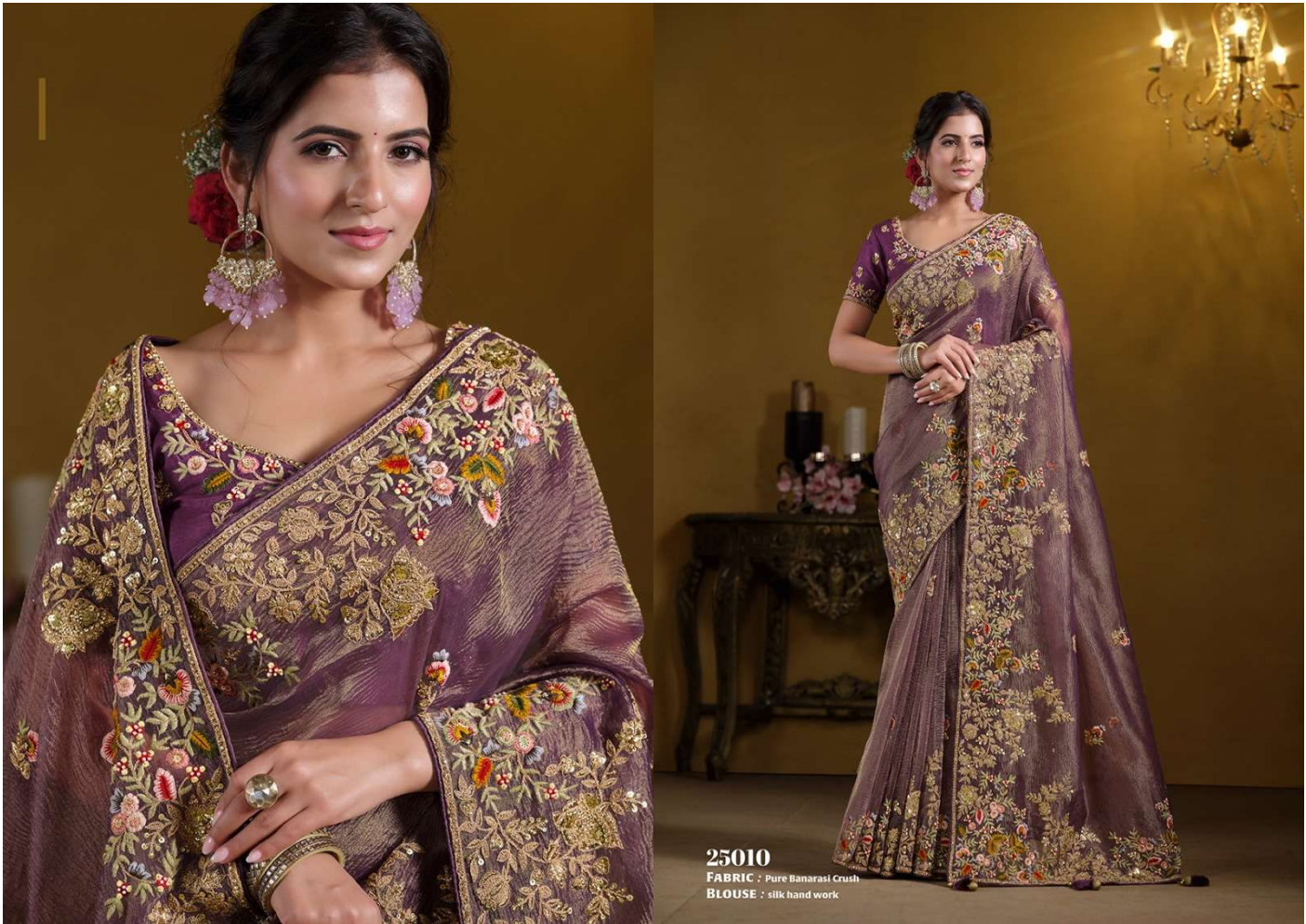
25010 FABRIC : Pure Banarasi Crush BLOUSE : silk hand work