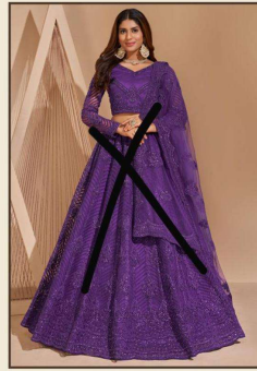
# 1006- F