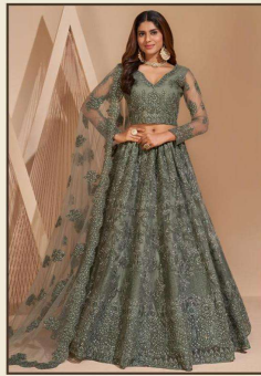
# 1007- G