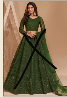
# 1006- G