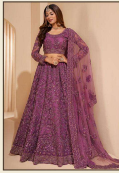
# 1003- G