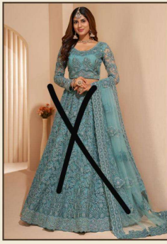
# 1003- F