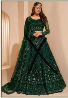
# 1005- F