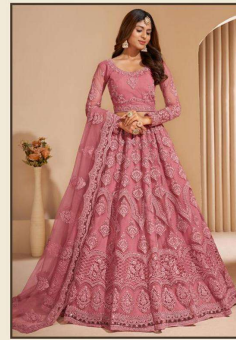
# 1008- G