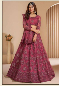
# 1004- H