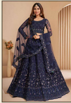
# 1005- G