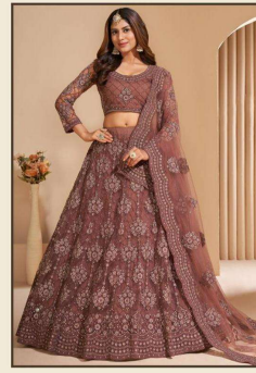
# 1004- I