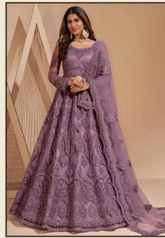
# 1008- F