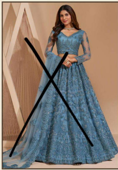
# 1007- F