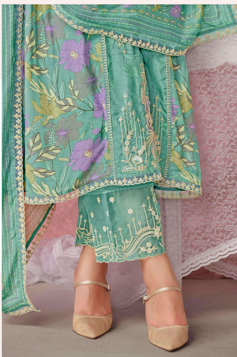
TIMELESS CHARM 9624