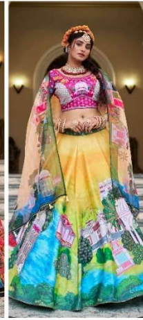
* 119 *