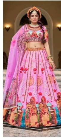
* 118 *