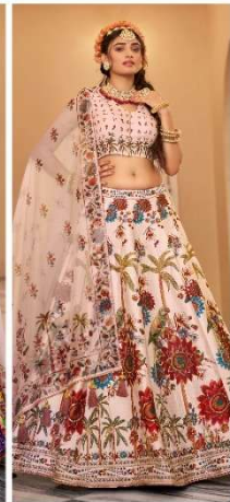
* 122 *