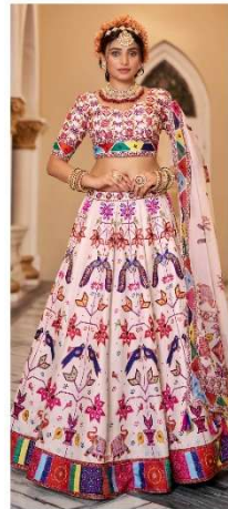
* 121 *