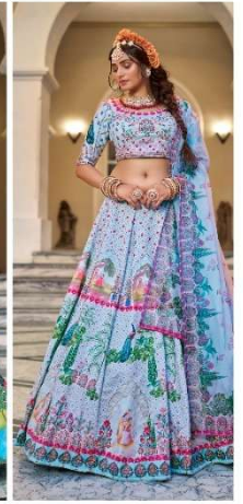
* 120 *