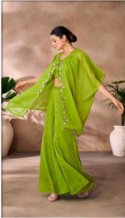
Vibrant lime green Co-Ord set with flowy silhouette and embroidered details. Embrace the playful yet elegant look with simple jewellery and comfortable sandals.