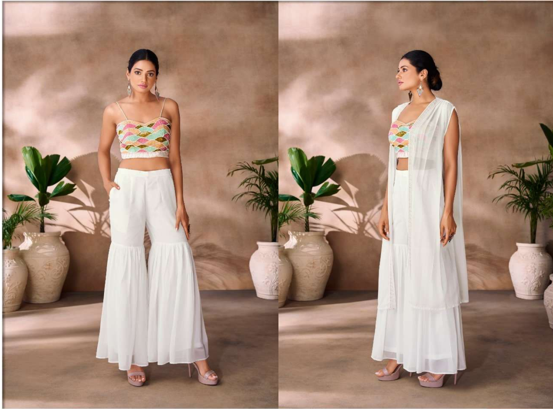
Crisp white Co-Ord set with a colourful embroidered crop top. This vibrant look is perfect for a fresh and modern style. Add statement earrings and nude heels to complete the ensemble.