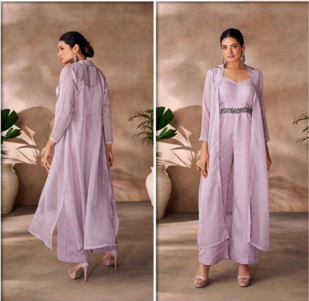
Lavender Co-Ord set with an embellished waist and long jacket. A sophisticated choice for any occasion. Style with silver jewellery and platform heels for a polished look.