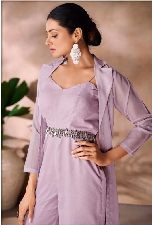
Lavender Co-Ord set with an embellished waist and long jacket. A sophisticated choice for any occasion. Style with silver jewellery and platform heels for a polished look.