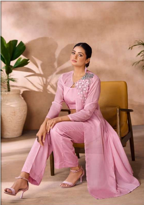
Blush pink Co-Ord set with an asymmetrical long jacket. The floral embroidery adds a touch of elegance. Pair with delicate earrings and strappy heels for a graceful look.