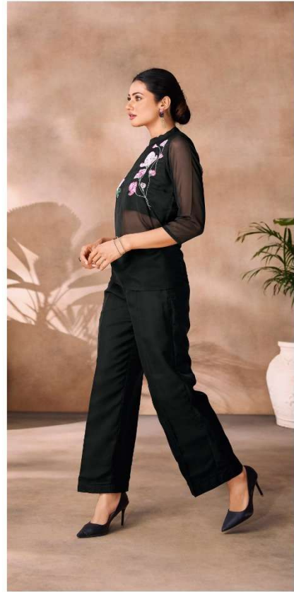
Classic black Co-Ord set with sheer top and floral embroidery. A modern twist on traditional chic. Style with bold earrings and black accessories for a striking outfit.