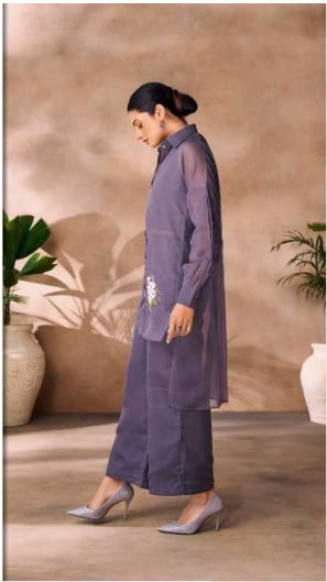
Slate grey Co-Ord set featuring a sheer shirt with a floral accent. This contemporary look is perfect for a minimalist vibe. Pair it with silver jewellery and sleek heels for an elegant finish.