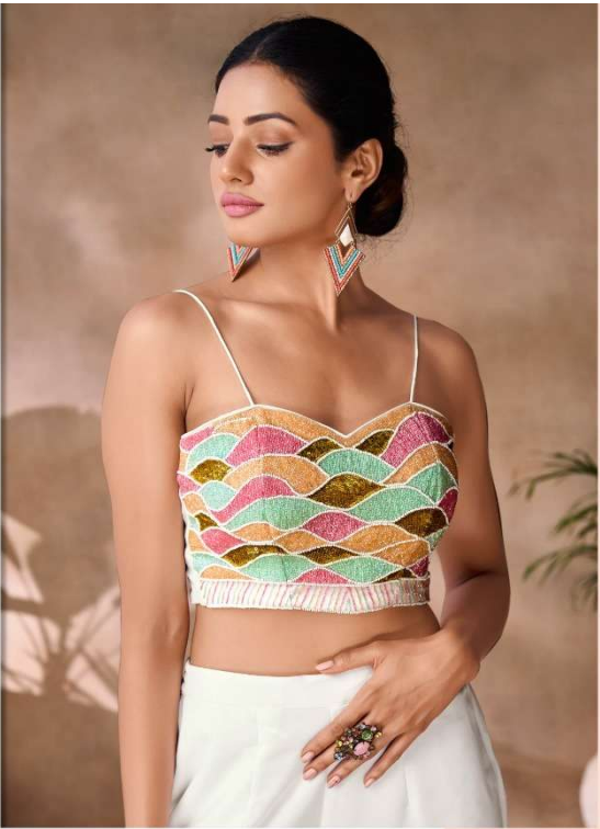
Crisp white Co-Ord set with a colourful embroidered crop top. This vibrant look is perfect for a fresh and modern style. Add statement earrings and nude heels to complete the ensemble.