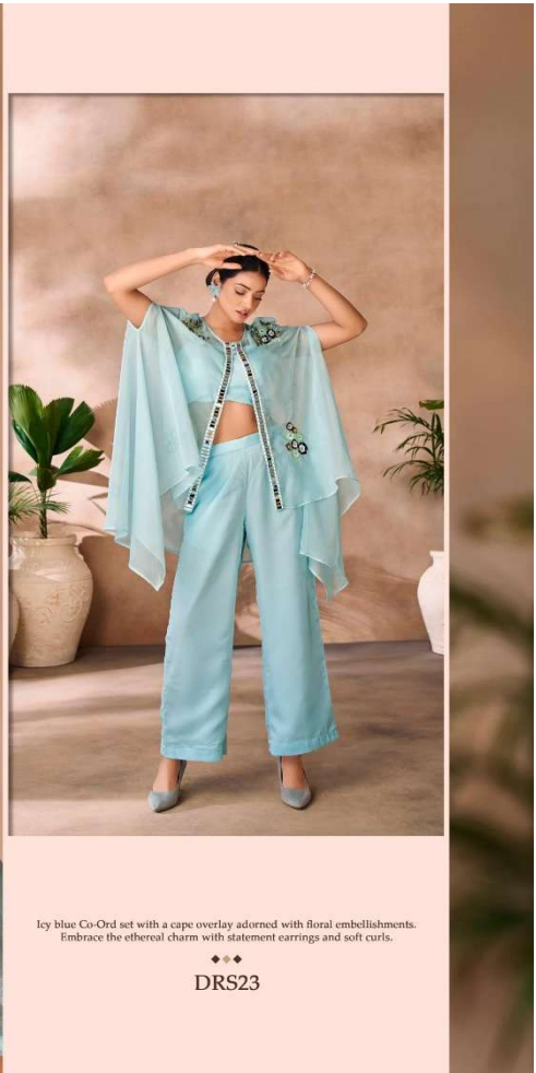
Icy blue Co-Ord set with a cape overlay adorned with floral embellishments. Embrace the ethereal charm with statement earrings and soft curls.