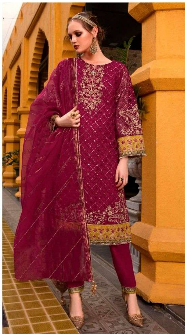
C 1342 A