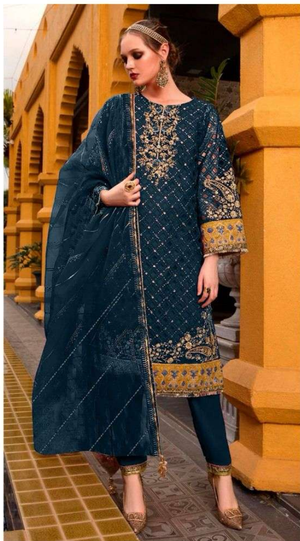
C 1342 B